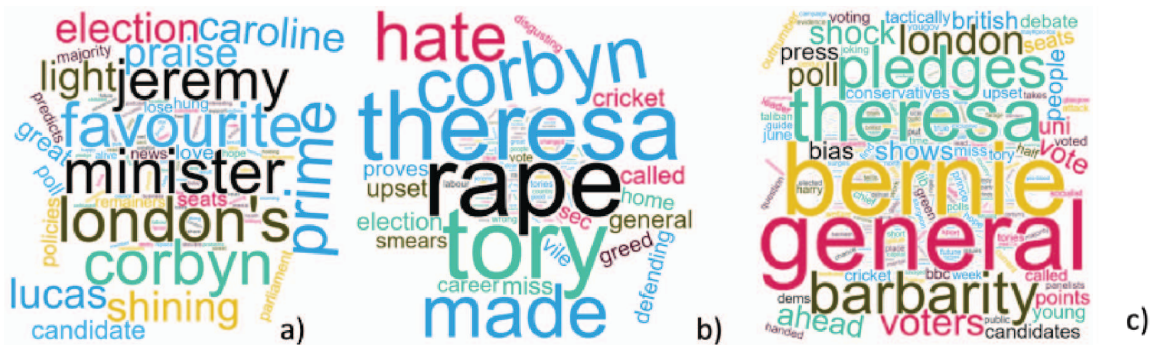
Fig. 3. 2 nd June 2017 word clouds based on the sentiment extracted from the tweets with the proposed method: a) positive, b) negative, c) neutral, when the poll tracker shows Labour at highest level in almost three years.