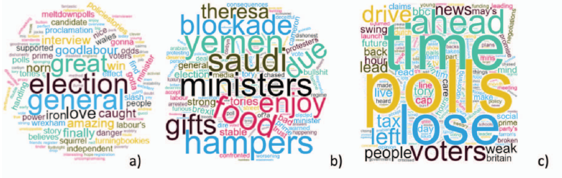
Fig. 2. 22 nd May 2017, word clouds based on the sentiment extracted from the tweets with the proposed method: a) positive, b) negative, c) neutral, when the campaigning go ahead with different topics and there is the Manchester terrorist attack.