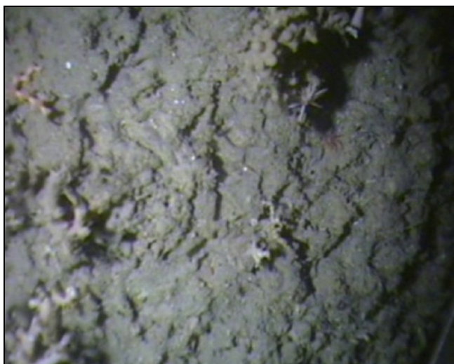
Figure 1: Detail of retired coral carbonate mound showing coral rubble habitats distinct from off-mound habitats. Picture for a north Porcupine Bank coral carbonate mound, September 2008

Some coral carbonate mounds do not support live coral reefs, and typically have low abundances of filter feeding benthos. Research is at an early stage but it is thought that unfavourable hydrodynamic conditions at these so called 'retired mounds' cause limited food supply or excessively strong currents lead to erosion of the coral framework. While some of these retired mounds are in the process of being buried and covered by thick layers of sediment (De Mol et al. , 2005), others appear more speciose than surrounding seabed areas by offering distinct coral rubble and hardground habitats that in some cases is even more biodiverse than live coral habitats (Jensen & Frederiksen, 1992, Mortensen et al. , 1995). The sponge assemblage diversity has been negatively correlated with live coral cover (van Soest et al. , 2007). Hence, the absence of live coral reefs does not make coral carbonate mounds less significant in terms of conservation priorities.