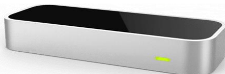
Fig. 1. The Leap Motion controller [21]

Scientists have examined various methods for presenting teaching materials that incorporate recent technological advances [3]. The aim of this study was to design and implement an educational system for chemistry experiments that simulated real-life experiments enhanced with molecular visualization. This work used the Leap Motion controller (Figure 1) in education and simulation fields to facilitate the learning process [21]. The Leap Motion controller is capable of recognizing hand gestures and has great potential, as it provides new intuitive methods of interaction that feel natural. The Leap Motion controller can identify and track the rotations and positions of both of the user's hands simultaneously, along with their fingers [20], [21]. The Leap Motion controller has applications in many diverse fields due to its high resolution and accuracy [38], [39], [40].