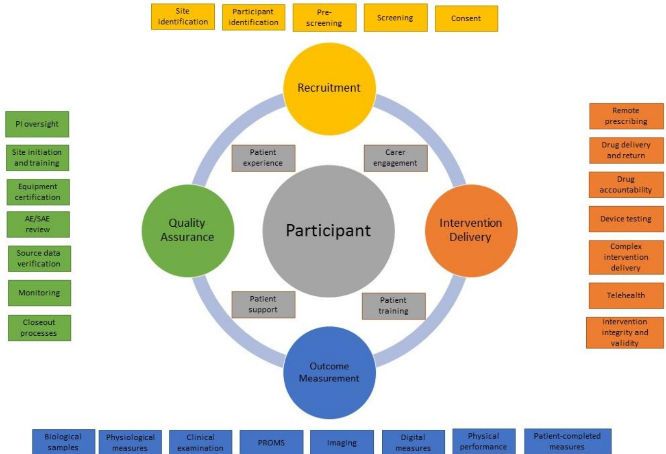
Figure 1: Key domains of clinical trial delivery

We formed 5 subgroups based on the key domains of the trial delivery pathway: participant factors, recruitment, intervention delivery, outcome measurement and quality assurance, as detailed in figure 1.