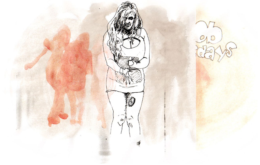
Figure 2. Still from the visual essay projected alongside the song 'Gin Palace People', showing images from the Mail Online redrawn to create a contemporary parallel to the Gin Craze of the song.