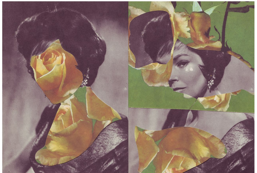
Figure 3. Stills from the visuals projected as an accompaniment to the song 'First Date', referencing and then breaking through a trope. © Stephanie Black.

greeted the Gin Craze of the early 1700s and offers a contemporary parallel by redrawing the 'booze-shaming' photographs from a British online tabloid newspaper with a vendetta against young women drinkers, where the latter are