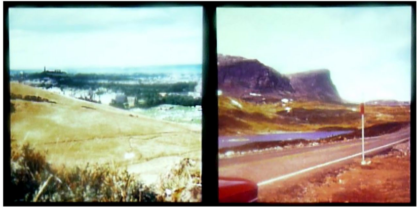
Figure 6. Stills from 'Anders from Iceland' released as a music video showing images of different countries united through shared 'pastness'.