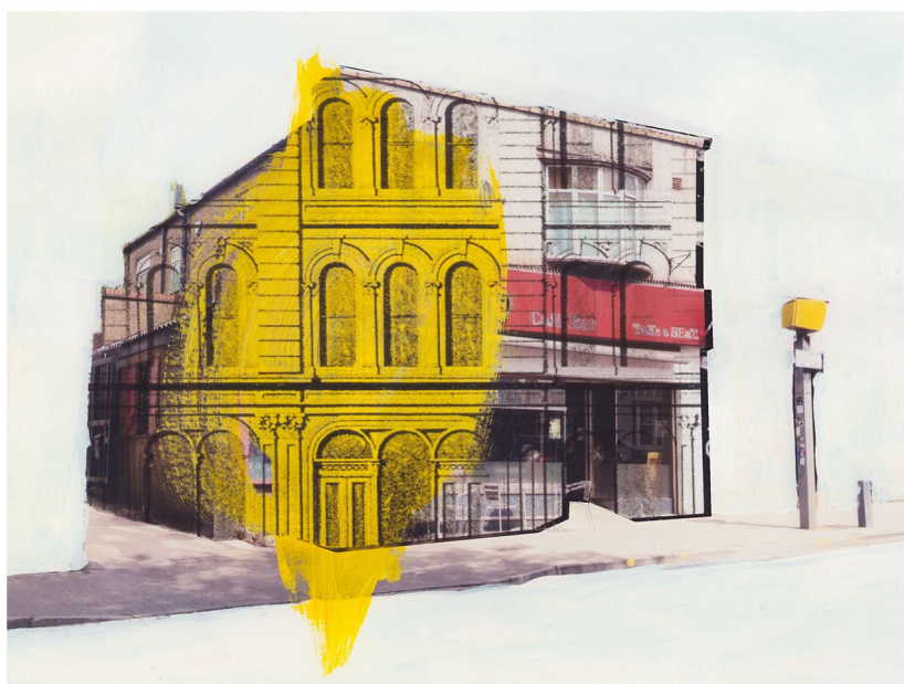
Figure 5. Still from the visual essay made to accompany the final song 'Long Forgotten' showing a 'caffy-pub'.

triggers removed as they can be found inside the building and are instrumental in its role as a restorative nostalgic enterprise. This café was founded by an estate agent/property developer/lettings agent as a pastiche of the living room in their 'period properties', thus making what had previously been one of the cheapest areas in the city appear aspirational and making it profitable. It is the domestic equivalent of the sentimental typical pub, where the imagined past is presented uncritically as good.