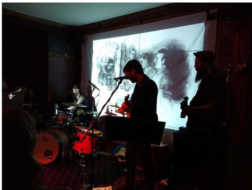
Figure 1. Plume of Feathers performance at the Stag and Hounds pub and music venue, Bristol, December 2016. A visual essay can be seen projected onto the screen behind the band.

illustrated children's books as the non-literal relationship between image and text that allows both to contribute to the story. Therefore the images produced to accompany songs were not necessarily of pubs and might include geometric patterns or photographs of buffets sourced from the internet. In collating the images, I created conceptual gaps between images which is possible because they are often sequences of still images rather than the more fluid transitions of film. This creates a slight disjunction as a puzzle. The images are also counterpoints to the songs they accompany, providing a different point of view. In this regard, the illustrations experienced with the music as part of a Plume of Feathers performance are one mode of a multimodal text; this creates further gaps between the parallel strands of the overall communication and asks the audience to span them, thereby creating fluidity from fragments. 3