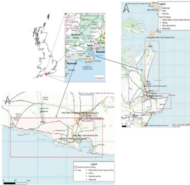
Fig. 15.1 Location of COVIM