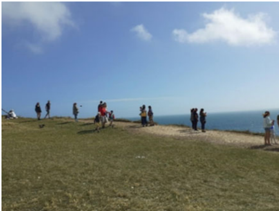
Fig. 15.4 Visitors at cliff edge above Man O' War Beach, Durdle Door

Despite years of underfunding, political involvement in the management of these areas, and a multitude of stakeholders involved in the