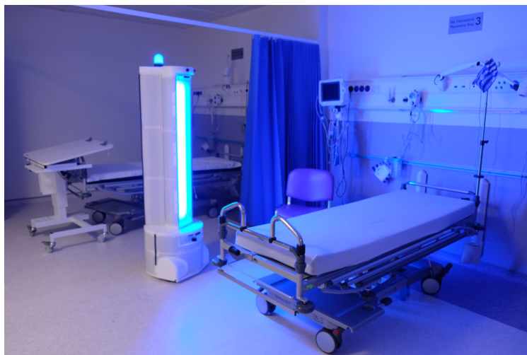
Figure 1: Example of a robotic UVGI platform being used to disinfect surfaces in a hospital.

There are currently no harmonized European or international standards for measuring the efficacy of room decontamination using UVGI technologies. The two most applicable standards are the French norm NF T72-281:2014 “Methods of airborne disinfection of surfaces” and the US norm ASTM E3135-18 “Standard Practice for Determining Antimicrobial Efficacy of Ultraviolet Germicidal Irradiation Against Microorganisms on Carriers with Simulated Soil”. Unfortunately, neither of these standards are suitable for evaluating the microbiological efficacy of mobile UV devices [6], such as that shown in Figure 1. The occupational safety requirements of UVGI is outlined in EU Directive 2006/25/EC, which provides formulae to calculate the maximum effective radiant exposure that a person can be subjected to over an 8 hour period. In the US, UVGI devices are regulated by the Environmental Protection Agency (EPA) as pesticide devices under the Federal Insecticide, Fungicide, and Rodenticide Act (FIFRA). However, unlike with chemical disinfectants, the EPA does not routinely review the safety or efficacy of UV light devices [1].