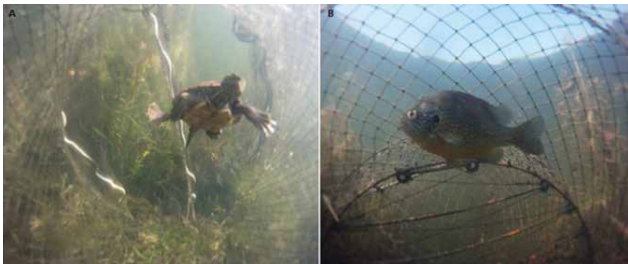
Figure 4. (A) Freshwater turtle and (B) sunfish documented in a commercial fishing net by an action camera device.

E. daemeli during early stages and were more efficient in determining presence/absence than conventional visual or trap surveys.