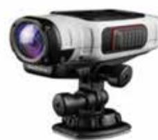
Garmin VIRB Elite