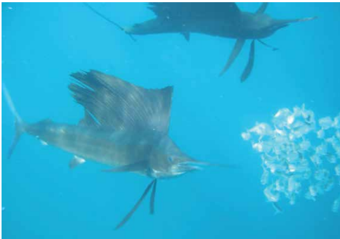
Figure 3. Action camera footage that captured a feeding event of an Atlantic Sailfish chasing a school of sardines.