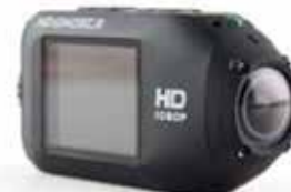
Drift Ghost HD