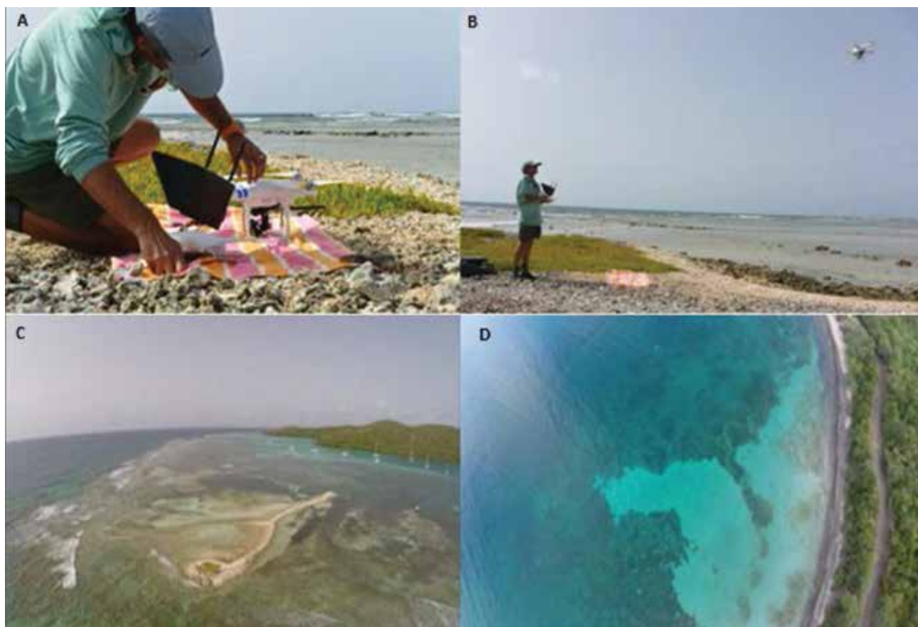
Figure 5. Multirotor UAV being used for habitat surveys in shallow tropical seas. (A) Mounting action camera to UAV. Photo credit: Tyler Gagne. (B) Remote control operation of UAV. Photo credit: Tyler Gagne. (C) UAV collecting high-definition imagery of reef habitat with action camera. Photo credit: Andy Danylchuk. (D) Large-scale habitat mapping from a UAV. Photo credit: Andy Danylchuk.

to ensure that such applications do not exceed tag burdens for aquatic animals and are streamlined to minimize drag.