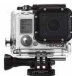
GoPro HERO 3

Due to their intended use in active recreational sports, the majority of AC products are “shockproof,” built to withstand drops from low-level heights or constant jarring. Similarly, many ACs possess integrated lithium-ion batteries and