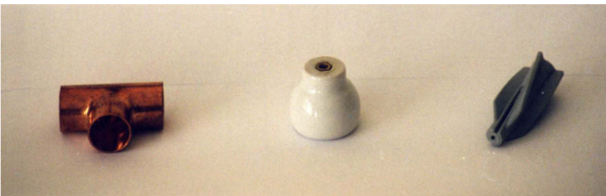
Fig. 1. One of the triads of objects used in the different experiments of this study. Which two objects were given which names was counterbalanced across participants.

After the presentation phase, the experimenter tested categorization by putting one object of the named pair in his own hand, placed at an equal distance from the remaining two objects, and asking the infant to give him “the one that goes with this one”. While waiting for the response, the experimenter looked at either the infant’s face or the object in his hand to avoid influencing the infant’s response. As soon as the infant had picked up an object, the other object was discreetly removed from the infant’s reach and positive feedback was provided regardless of the choice made. Successful performance corresponded to the selection of the similarly labeled object.