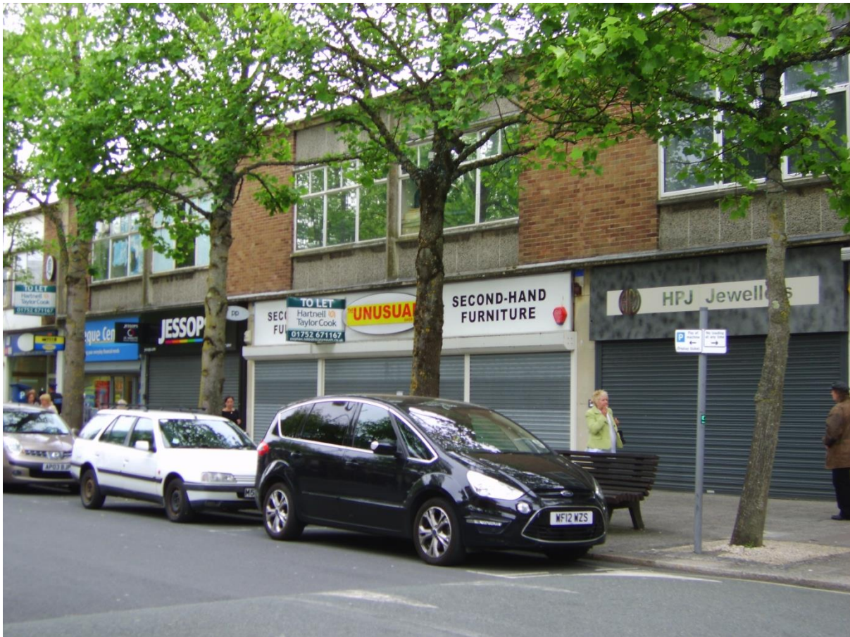
Figure 3: Abandoned shops in Plymouth city centre.

will tend to use the streets less. This will disincentivize further business or retail uses. Or, as Jan Gehl puts it in a simple and powerful way: ‘nothing happens because nothing happens’ (Gehl 2011: 75).