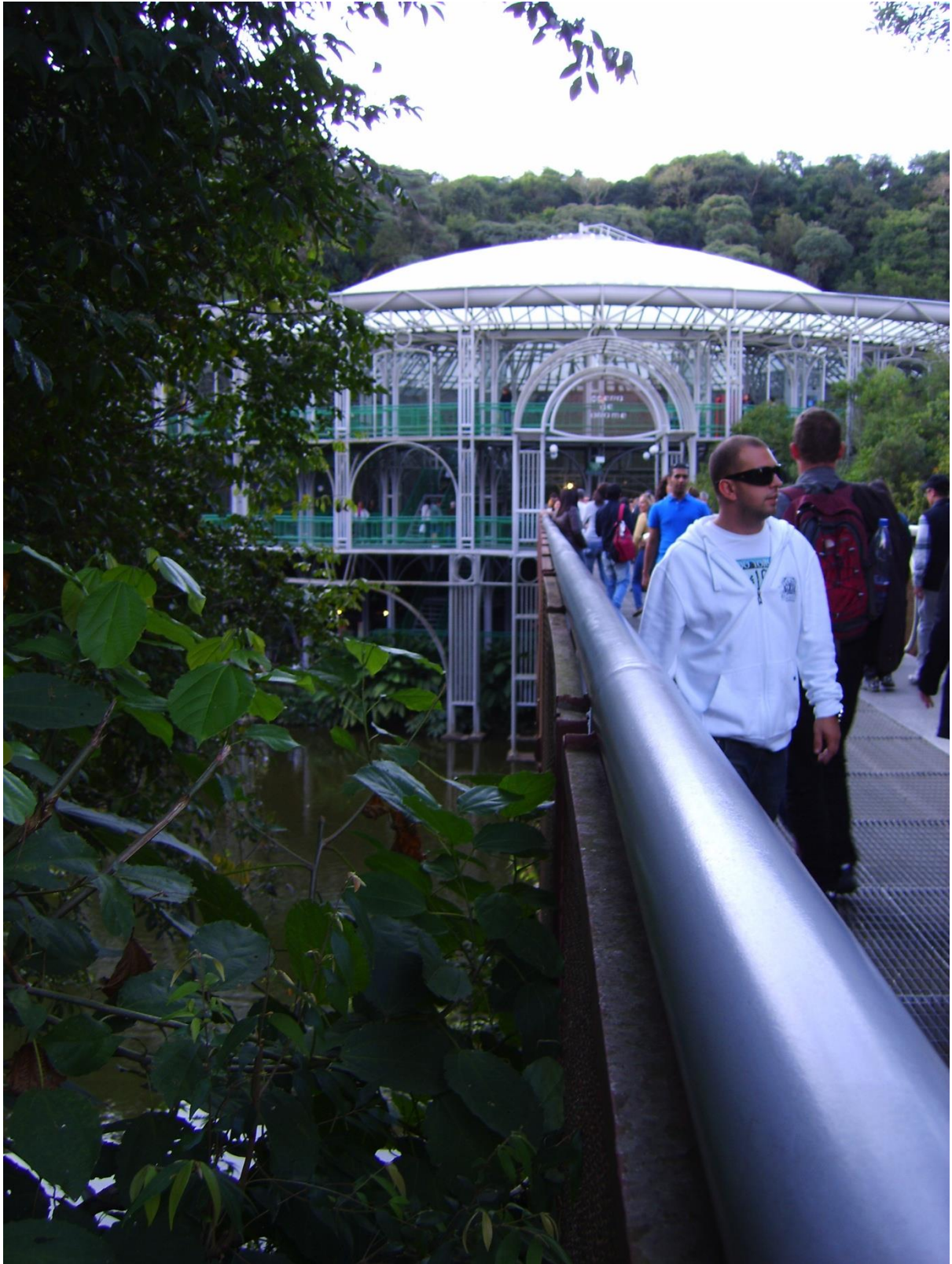
Figure 4: The Opera de Arame in Curitiba, Brazil.

Approaching the design and production of a more adaptive smart city therefore needs to take into account two only apparently contrasting dimension: it needs the strategic, empowered and public