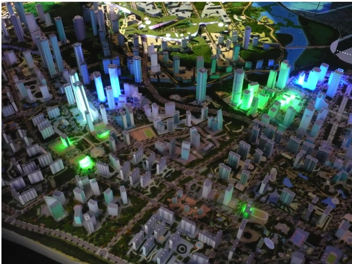
Figure 2: The masterplan model of Sejong City.

Yet, a sanitized smart city of big data and expert algorithms has its limits and drawbacks. As Manuel Fernandez puts it in his blog : ‘Masdar, Incheon or Songdo are large projects that give us an idea of