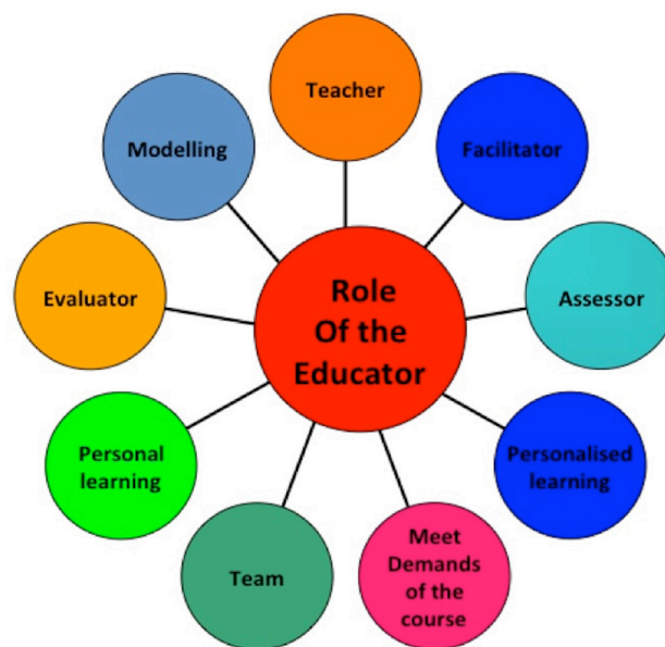
Diagram 1. Competencies for the medical educator