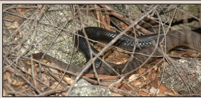
FIG. 1. Pseudechis porphyriacus attacking a Tropidechis carinatus in North Queensland, Australia.

Queensland, Australia, we observed a P. porphyriacus (total length ca. 1.5 m) attacking and trying to depredate a T. carinatus (total length ca. 1 m). When we first encountered the snakes, both had the anterior halves of their bodies within a rocky den, with their tails entangled outside. Approximately one minute following the encounter, the T. carinatus emerged from the den with the P. porphyriacus gripping it strongly with its jaws on the right lateral aspect of its body, approximately 20% of its body length below the head. The T. carinatus tried to escape by crawling away, but the P. porphyriacus did not release the lock-bite for approximately 30 sec. Following this interaction, the P. porphyriacus may have become aware of our presence, and released the T. carinatus . The T. carinatus proceeded to move away from the area to a protected den adjacent to the point of original observation. The duration of the interaction, from the first time point when we discovered the snakes, to the escape of the T. carinatus , lasted 5 min. Because the T. carinatus sought refuge in a den, we were not able to observe whether it recovered from its bite and possible envenomation by the P. porphyriacus .