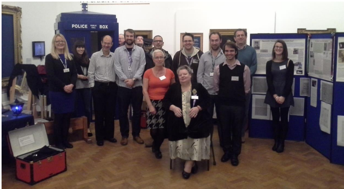
Some of the many participants involved in the day's events