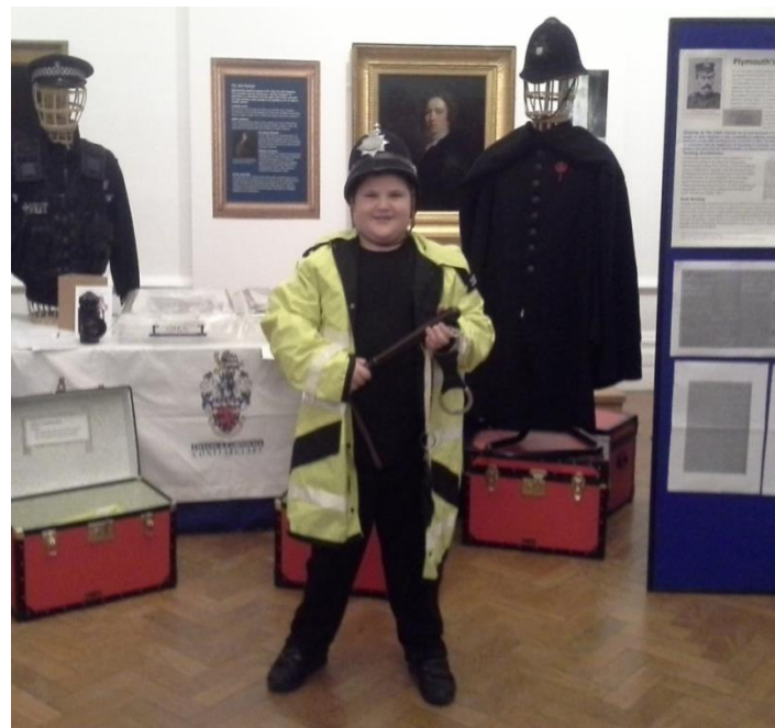
A potential police recruit enjoying his visit to the exhibition