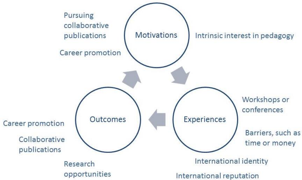
Figure ????: Motivations, experiences and outcomes of academic networking