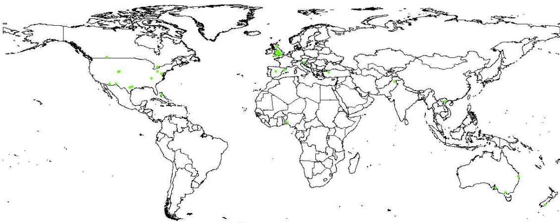
Figure ????: Geographical locations of UK interview respondents