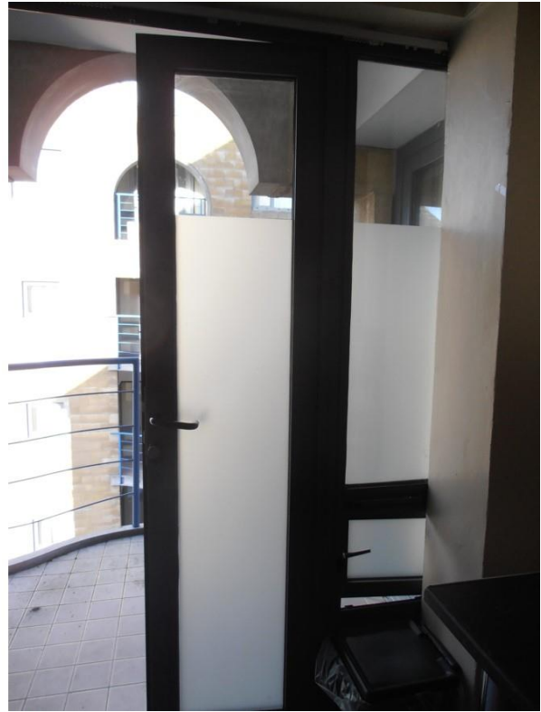
Figure 1: Unintentional invasions of privacy in Robert's bedroom (L) and modesty screening on Chen's balcony doors (R) (author's own photographs).