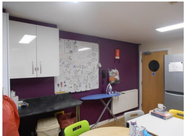
Figure 2: Displaying photographs on Peter's pin board (L) and doodles left by guests on Gary's whiteboard (R).