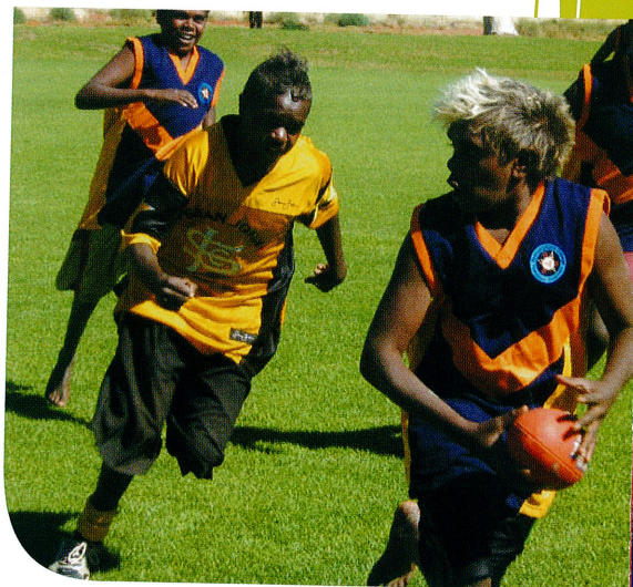
AFL is a passion for many Territorians.

This teaching experience enabled me to further identify the Kingdom of God within both the culture I live and the culture of the Anangu people, thus linking my faith with the students' culture. As Catholic educators