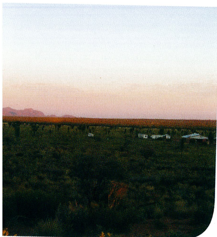
Kata Tjuta (Olgas) in Australia's remote outback