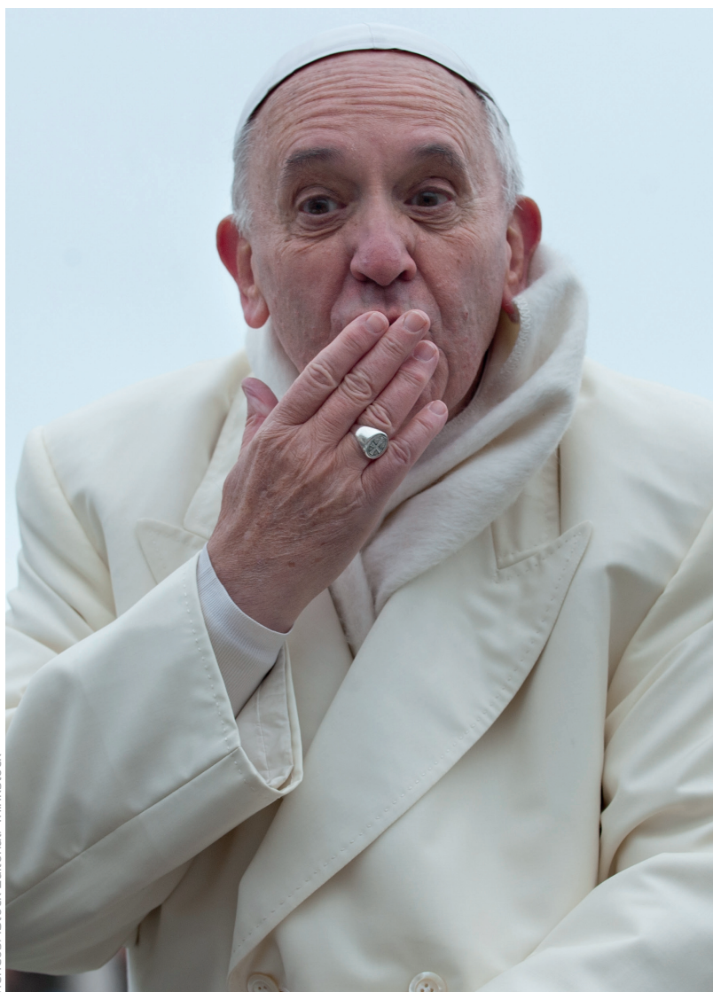
LEFT Pope Francis, pictured in November 2013, sends a kiss to the faithful gathered in St. Peter’s Square, Vatican City

For most popes in our data set the post-election survival time is the same as pontificate length. The exceptions are Pope Gregory XII and Pope Emeritus Benedict XVI. We performed inference in the Bayesian framework, and so we