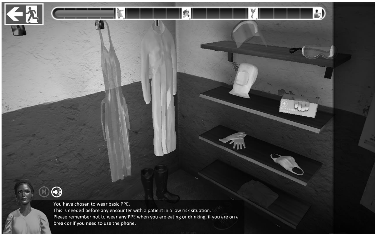
Figure 4 Repetitive self-assessment / feedback through the use of visual checklists and audio feedback from virtual buddy. Learner enabled interaction to make choices regarding correct PPE donning and doffing steps.