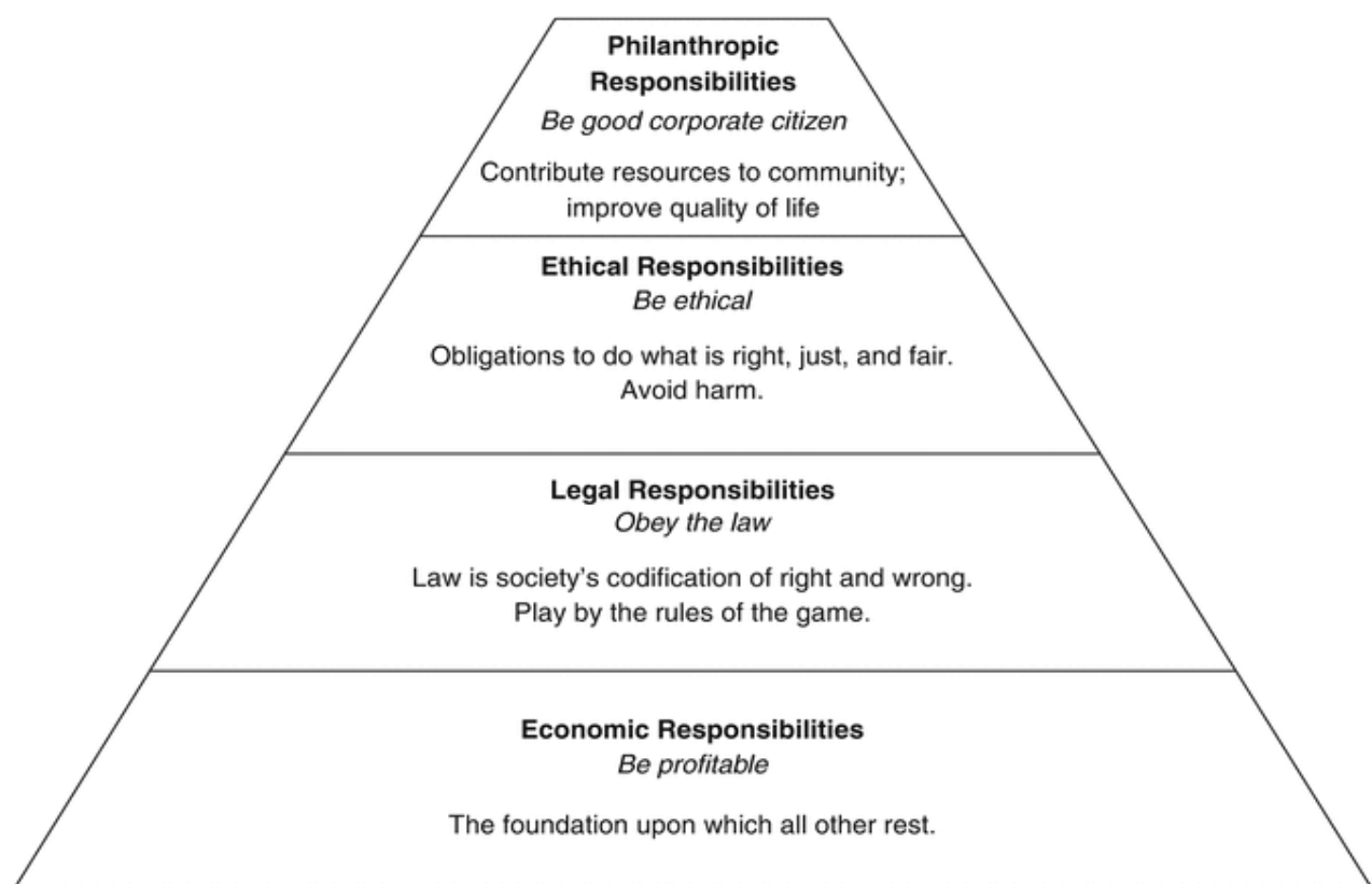
Figure 2.1: Carroll's pyramid of social responsibility

2007). The ethical responsibility reflects the need for companies to perform in an ethical way without causing any damage to either the environment or the community by complying with the legal category (Solomon, 1994). The discretionary dimension reflects the benefits companies offer to societies in the shape of donations. Carroll (2004) modified this dimension and renamed it “philanthropy”. It was argued that these four dimensions of CSR can form a pyramid with the economic dimension as its base.