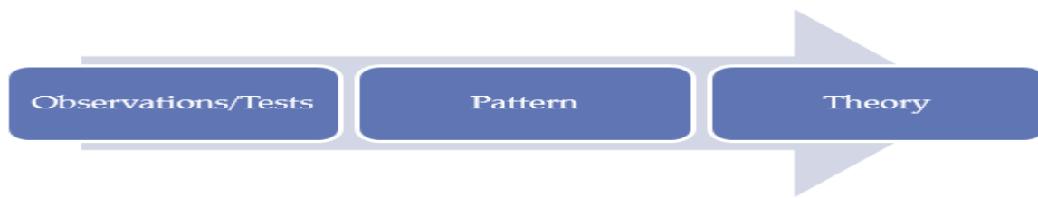
Figure 4.3: Inductive process