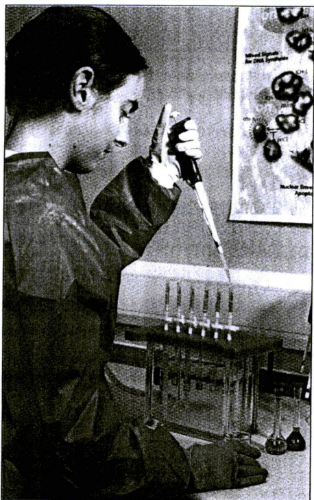
Solid-phase extraction of drugs and metabolites within the research laboratory

four years. Clinical audit is considered here as a research activity, partly because of its interaction with other research functions (pharmacoeconomics, clinical research), and also because recommendations and solutions to problems often arise as a result of audit. An agreed programme of clinical audit is set out at the beginning of each year and is included in the pharmacy business plan. Clinical audit is led by a clinical audit pharmacist ("D" grade), who is supported by other pharmacists within the department, many of whom have attended a training workshop on the principles and practice of clinical audit.