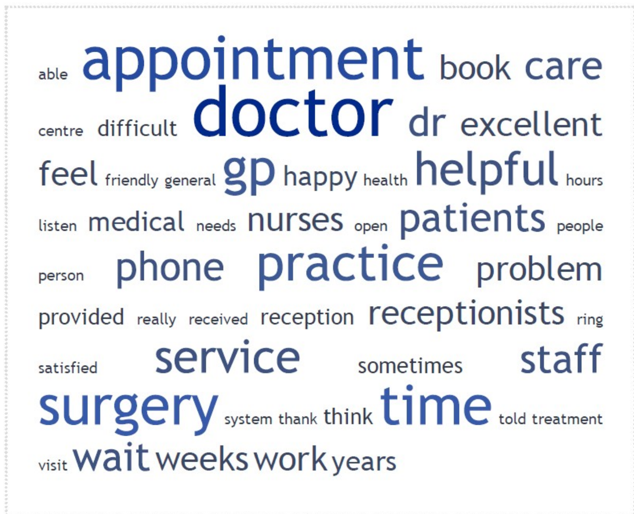
Figure 1. Single-word text cloud created in TagCrowd from all free text comments.

Figure 3 shows the results of the Voyant Tools distinctive words component when applied to comments categorized as originating from satisfied or dissatisfied patients. The words “surgery”, “excellent”, “service”, “good”, and “helpful” were the five most distinctive words from satisfied patients, while the words “doctor”, “feel”, “appointment”, “rude”, and “symptoms” were the five most distinctive words in the comments from dissatisfied patients.