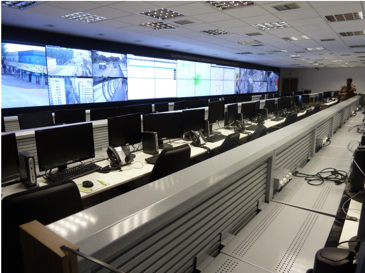
Figure 2. Urban control room in Curitiba, Brazil.