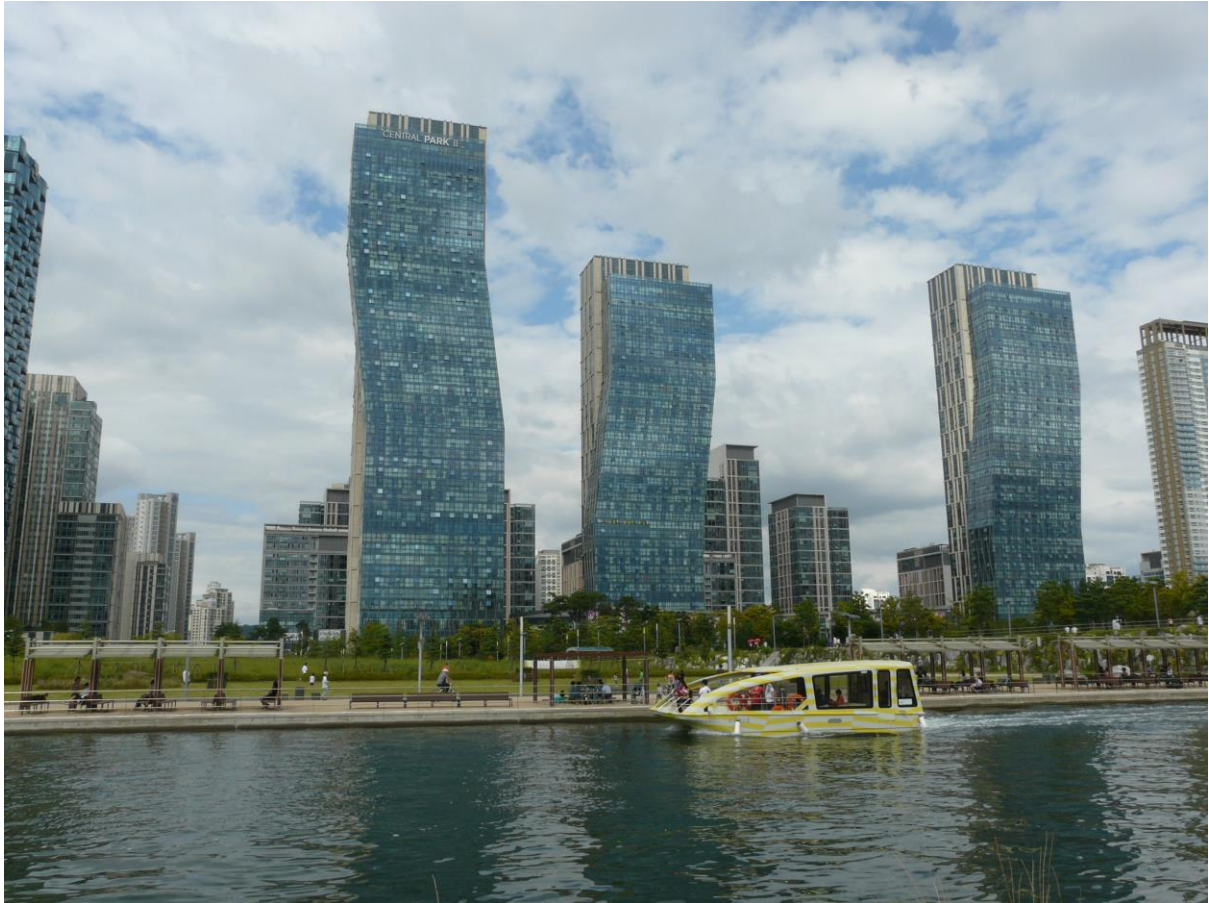
Figure 1. Songdo, South Korea: smart city and its modernist urban form.