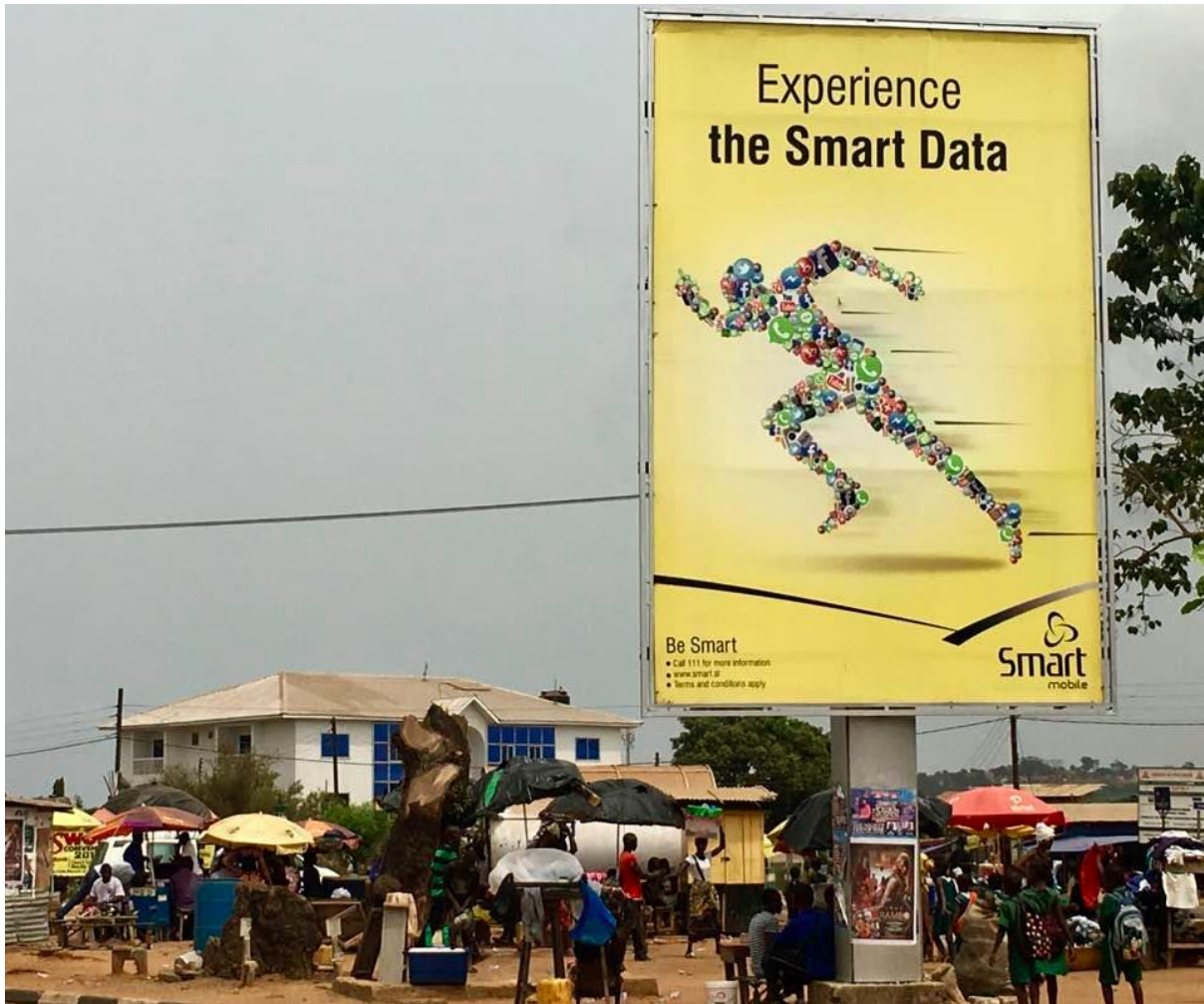
Figure 3. Smart and hyper-local and community realities in Africa.