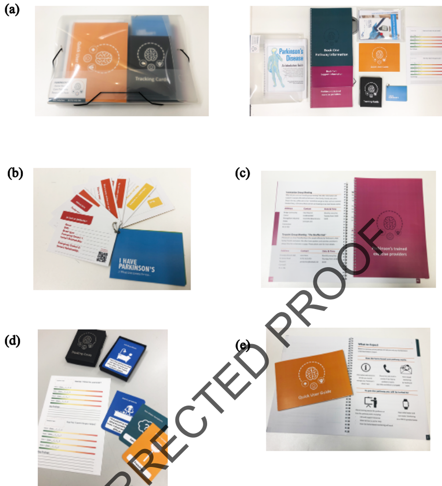
Fig. 3. Home-Based Care resource pack. (a) The Home-Based Care Pathway pack; (b) Parkinson's patient passport; (c) Service and local information; (d) A card deck to support self-reflection; (e) A self-management support and general information package. The pack included information about Parkinson's service provision and support available for PwP and care partner; details of a single point of contact; information about Parkinson's disease; information and guidance for symptom monitoring and management; lifestyle advice; a Parkinson's patient passport to capture key aspects of Parkinson's important to the PwP.

(MDS-UPDRS II)), the Non Motor Symptoms Questionnaire (NMSQ), the Parkinson's Disease Sleep Scale 2 (PDSS2), and the Hospital Anxiety and Depression Scale (HADS). A bespoke questionnaire on medications and the main concerns of PwP and their care partners was also created (see Questionnaire 1, Supplementary Material).