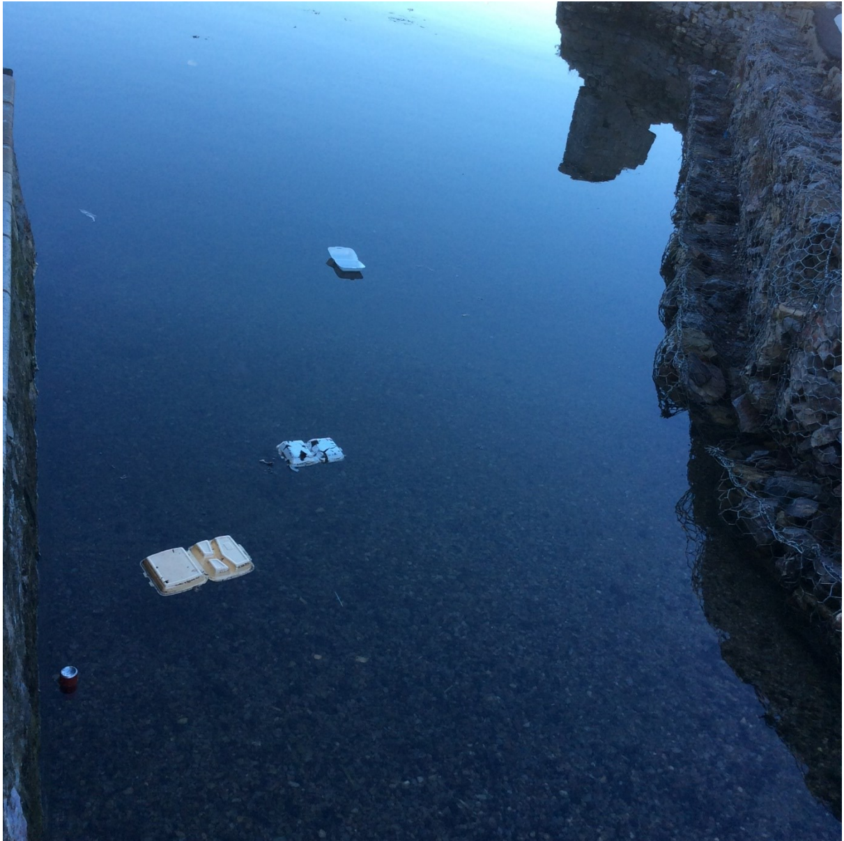
Figure 14: Detritus