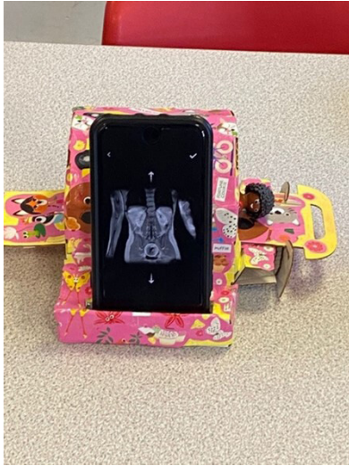
Figure 2 Augmented reality (AR) mode.

which is deliberately designed to be slightly too difficult for a child to be able to build alone, thus encouraging them to seek the help of a parent/carer. Parent/carer involvement is important because parental levels of anxiety often directly affect those of their child. 5 The design allows the child to use their own toys, such as soft toys or small figures, to further explore the model and encourage further play, storytelling and creativity to aid familiarity with the scanner and scanning process. 11 Furthermore, because this part is made of cardboard, it encourages repeated play with no requirement for independent access to technology; young children may not have their own smartphone.