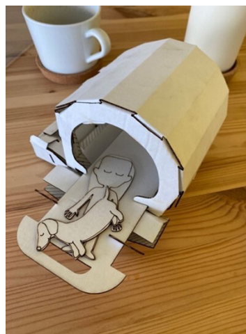
Figure 1 Cardboard MRI scanner.

The playkit was developed as a solution to assisting children aged 4–10 years to undergo MRI scanning without a GA. It contains a flat-packed cardboard kit for building into a small toy MRI scanner (figure 1),