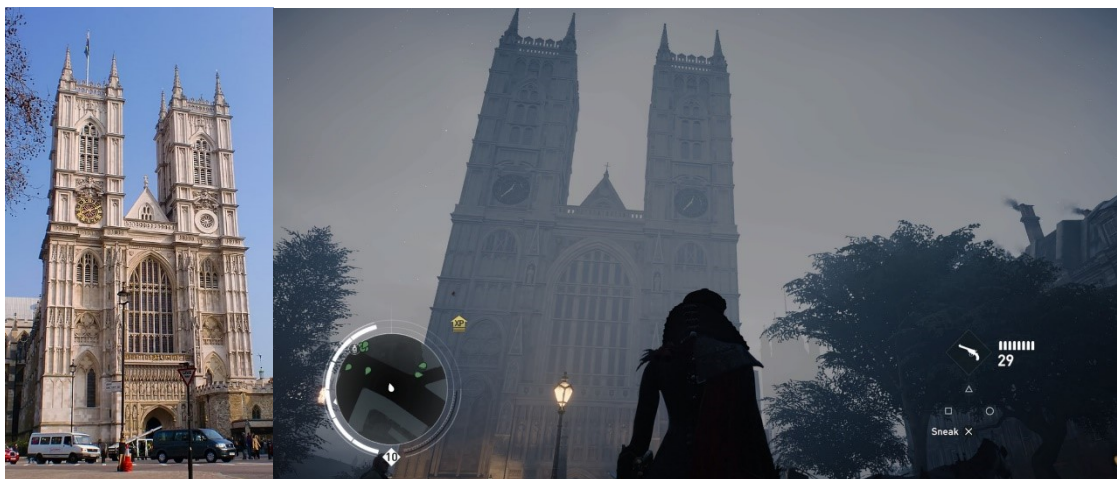
Left: Photograph of Westminster Abbey. Right: Screenshot of Westminster Abbey as recreated in Assassin's Creed Syndicate . 51

The above quote from Roy acknowledges the design decisions that transition the focus away from accurately recreating London and instead attempting to provide an ‘authentic impression’ (Sapieha, 2015). It would be far too time-consuming and costly to realistically create a digital version of Victorian London, but the developers can only stray so far whilst still claiming to provide a version of London. Therefore, the key landmarks are still present, but their position in the London area are not always accurate, distances between streets, and even the location of some of the boroughs is inaccurate, notably Whitechapel. Yet, this does not do enough to pull the average player out of the experience, especially not at first. It is also likely that for many players this will be their first instance of exploring a version of London freely, in turn, this will contribute to defining their perception of the city.