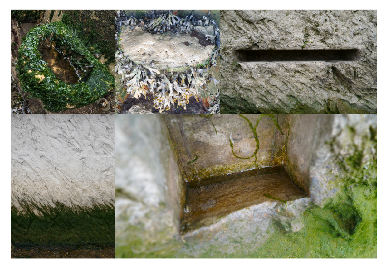
Fig. 2. Examples of coastal eco-engineering. Top left, clockwise: An artificial rockpool containing water (Marineff Project); a Vertipool containing mud (Bone et al., 2022); a 'letter box' crevice in a concrete seawall; a cubic void containing water in a concrete seawall; a concrete seawall with a 'rockface' textured surface created with a formliner.

There is some evidence that concrete is already more bioreceptive when compared to other materials and leaches chemo-attractive cues that encourages the settlement of some species (Anderson and Underwood 1994). For example, Anderson (1996) conducted lab and field tests that determined that calcium hydroxide leachate from cement enhanced recruitment of Sydney rock oysters ( Saccostrea glomerata (commercialis) Gould, 1850). Several explanations as to the mechanism of this chemical cue were offered, including its indication of a potential site of high planktonic productivity and thus food resource, or its molecular role in triggering metamorphosis in larvae. Davis et al. (2017) found that, compared to High Density Polyethylene (HDPE) and granite, concrete was more bioreceptive to algal turf in mesocosm experiments, which may have been due to the dissolution of calcium from the