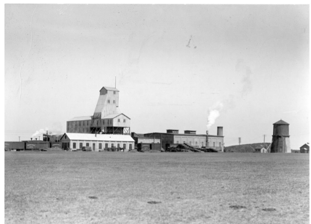
The Galt Number 6 mine in Hardieville was the main employer of Okinawans until its closure in 1935.