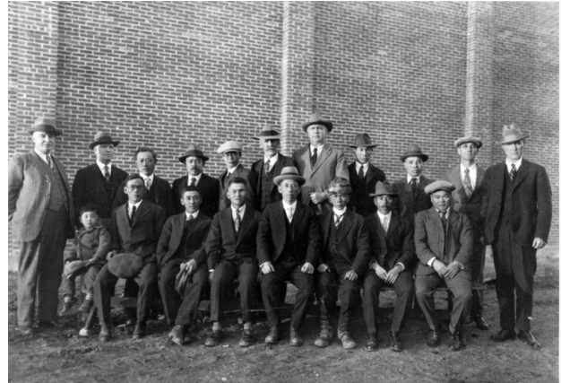
This photograph commemorates land and business transactions between the Japanese and The Church of Latter-Day Saints. The building housing the Raymond Buddhist Church was a former Church of Latter-Day Saints schoolhouse. Southern Alberta was home to a large and influential Church of Latter-Day Saints settler presence. Japanese maintained cordial and co-operative relations with this community who shared similar outsider status.