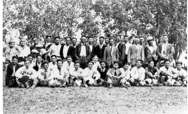
With the formal establishment of Buddhism in 1929, efforts to generate ties between the Raymond Japanese and Hardieville Okinawan communities included initiatives for youth congregation. This image from 1935 depicts members of Raymond's and Hardieville's Bukkyō Seinendan.