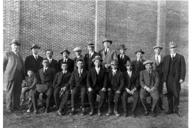
This photograph commemorates land and business transactions between the Japanese and The Church of Latter-Day Saints. The building housing the Raymond Buddhist Church was a former Church of Latter-Day Saints schoolhouse. Southern Alberta was home to a large and influential Church of Latter-Day Saints settler presence. Japanese maintained cordial and co-operative relations with this community who shared similar outsider status.