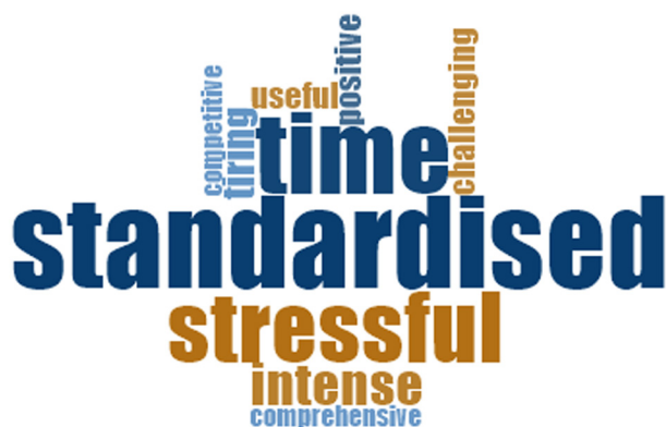
FIGURE 2 2017 word cloud.