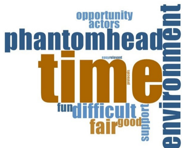
FIGURE 3 2018 word cloud.

The NVivo analysis produced a word cloud frequency for 2018 (Figure 3) which drew out the largest theme of time, this was once again in relation to critical appraisal. The introduction of a new environment, namely the introduction of a clinical skills station in a phantom head suite, created the next biggest themes.