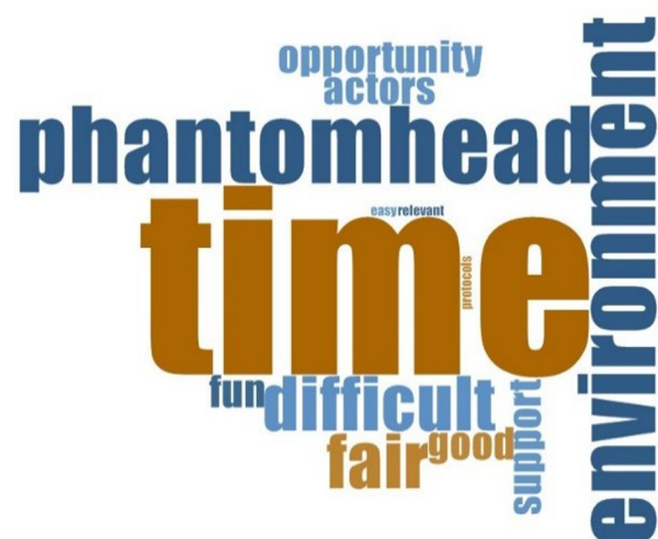
FIGURE 3 2018 word cloud.

The NVivo analysis produced a word cloud frequency for 2018 (Figure 3) which drew out the largest theme of time, this was once again in relation to critical appraisal. The introduction of a new environment, namely the introduction of a clinical skills station in a phantom head suite, created the next biggest themes.