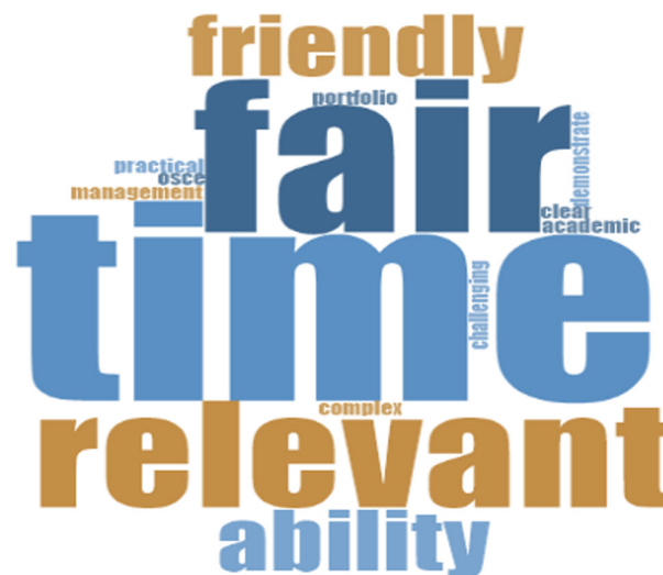
FIGURE 4 2019 word cloud.

The NVivo analysis produced a word cloud frequency for 2018 (Figure 3) which drew out the largest theme of time, this was once again in relation to critical appraisal. The introduction of a new environment, namely the introduction of a clinical skills station in a phantom head suite, created the next biggest themes.