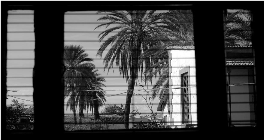
Figure 1.1: Father-land film still: view through apartment window in the old walled city of Nicosia, close to the Buffer Zone.

by a low sun, framed on the left by a curtain of eucalyptus leaves on the tree growing in the middle distance. Fair-weather clouds move gently across the sky, as the voice of an unseen woman shares a memory from her childhood: ‘I was walking along the back streets with my friend who’s a Cypriot boy . . . ah, whose name I can’t remember now. I was about seven . . . and he took me to visit his grandmother who used to process carobs.’ 4