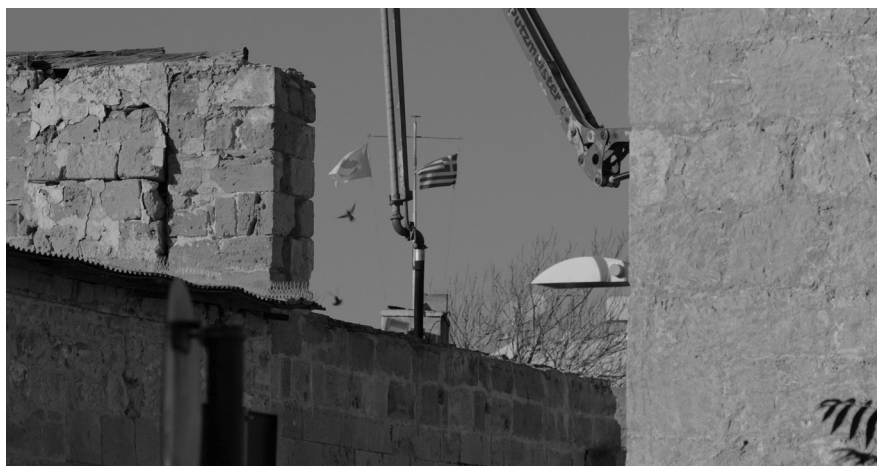
Figure 1.5: Father-land film still: view across Nicosia Buffer Zone.