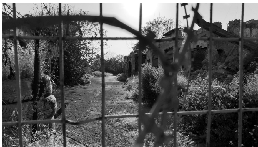
Figure 1.7: Father-land film still: Ermou Street, Nicosia Buffer Zone.

of razor wire (Figure 1.7). In the two years since we first visited, the guard hut by the gate was now unmanned – suggesting some change in the status quo – so we were free to record some narration.