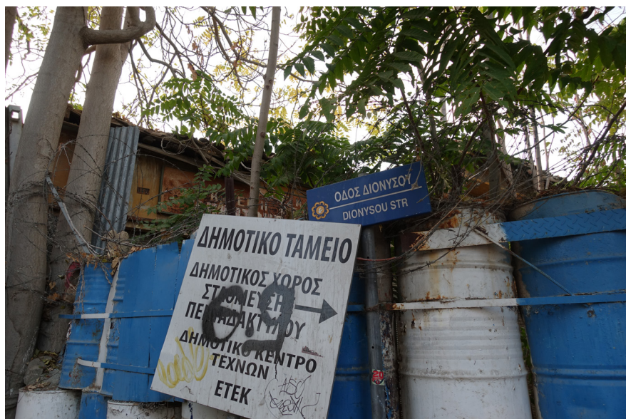
Figure 1.4: Father-land documentation: filming location, Dionysou Street, Nicosia Buffer Zone.

about the complex cultural and political histories of Nicosia, of Britain's colonial legacies, and the intercommunal violence of the 1950s and 1960s that had led to the displacement of large numbers of the island's population and the partition of Cyprus in 1974. These experiences and the exchange of views and ideas with people who lived in Nicosia or who were temporary residents like us were integral to creating our collaborative film. The conversations directly informed the narratives of memory and conflict we developed in response to the artist residency and were important in understanding the human impacts of these events and the lack of a political solution, embodied by the enduring inertia and emptiness of the Buffer Zone.