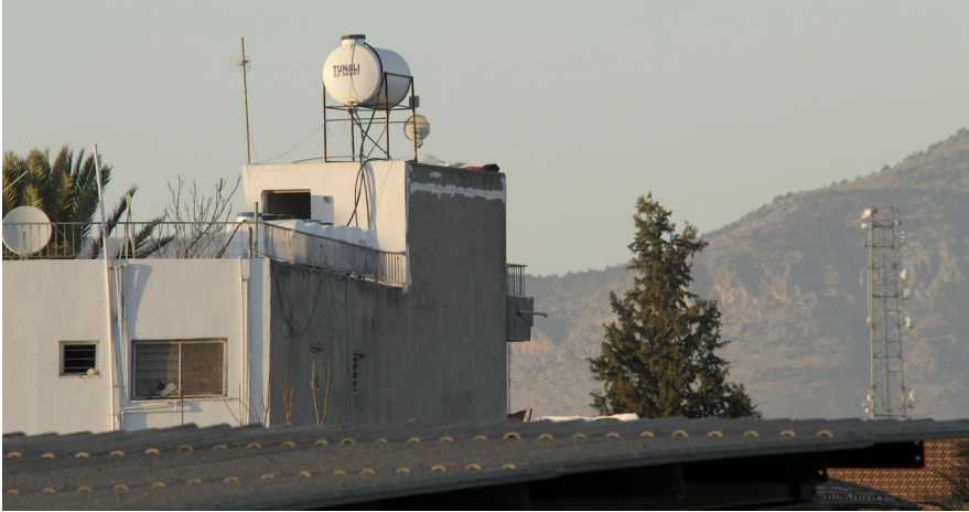
Figure 1.3: Father-land film still: view north across the Nicosia Buffer Zone towards the Pentadaktylos Mountains.

which continued until the end of our residency period in December. When the bar was closed, padlocked heavy metal gates secured the entrance to the courtyard. As the resident artists, we had a key to open and close the padlock. When the Powerhouse was shut, we were the only people in this area, which then became our private space. From the apartment on the first floor, we could access the flat roof of the restaurant. From this vantage point, the tops of partly built high-rise buildings and huge tower cranes encroaching from the south were visible behind us. Construction had been halted by the 2012–2013 economic crisis in Cyprus, and some regeneration work had recommenced – during the daytime, we could hear constant building activity and observe the movement of cranes in the sky to the east and west. To the north, we had an extensive view over the abandoned buildings and trees growing in the Buffer Zone, the tops of taller buildings in North Nicosia, and across the expanse of the Mesaoria plain beyond the city to the Kyrenia mountain range.