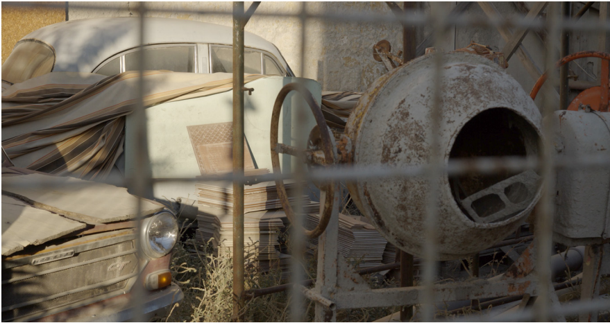
Figure 1.2: Father-land film still: cars abandoned in 1974, Tempon Street, Nicosia, close to the Buffer Zone.

Greek and Ottoman musical motifs. 8 Throughout the film, the sources of the ambient noises of construction, passing cars, birds, and low male voices are never identified specifically. The origins of these background location sounds exist off screen but are understood by the audience to belong to the world created on the screen and affect the atmosphere and mood (Figure 1.2). The narration is spoken by a man and a woman who are not seen or identified, and their function is never explained. As the film unfolds, the voices recall memories that relate to their childhood. They share their emotions and express their thoughts about their environment and the past.