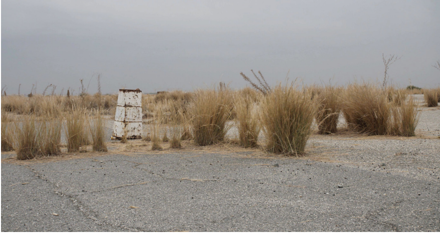
Figure 1.6: Father-land film still: runway, Nicosia International Airport, abandoned in 1974, Nicosia Buffer Zone.

under UN control in west Nicosia. The weather during our residency period was unusually warm and sunny, with temperatures in the mid-30s or high 20s Centigrade until our final week, when the skies began to cloud. At 9:30AM we were issued with passes at Foxtrot Gate and then escorted by Major Szakszon to the disused airport control tower and the abandoned airport complex. We had one hour to film as the first light drops of rain fell.