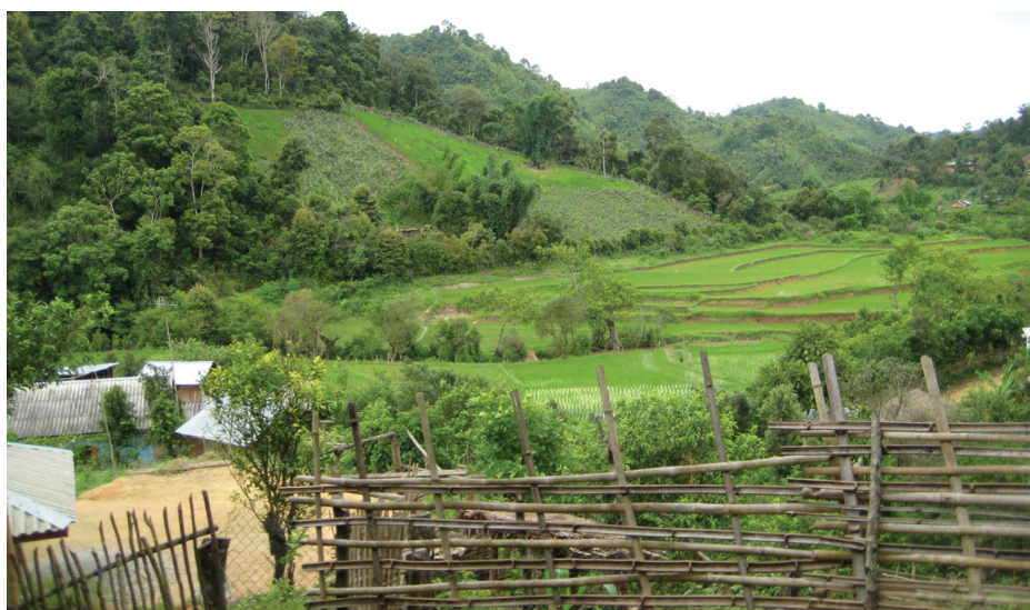
Figure 1: Land-use systems are often mosaics, incorporating multiple forms of land use simultaneously. In this village in the Philippines, irrigated rice fields are grown near the settlement, while the hillsides are used for swidden farming. This land-use regime would be classified as agriculture in level 1 of the LandCover6k land-use classification (Fig. 2), flooded-field farming and swidden in level 2, and rice paddy/taro pondfield in level 3. Domesticated animals and crops would be coded separately.

Agriculture is the most internally diverse land-use class, reflecting both its history and significance to landscape transformation. The level 2 classification of agricultural forms (Fig. 2) is therefore the most finely subdivided. Not all croplands are