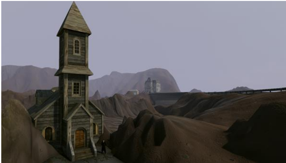
Figure 1: The 'ex-gay' Church with the Motel and House in the Distance

Queer Psycho , a work developed by Author A in early 2022, is an immersive exploratory narrative, a re-working or deconstruction of key scenes and tropes from Hitchcock's film of 1960. The work deploys Brechtian A-effect and Queering strategies to break the canonical patterns and subjectivities of immersive technology and cinema.