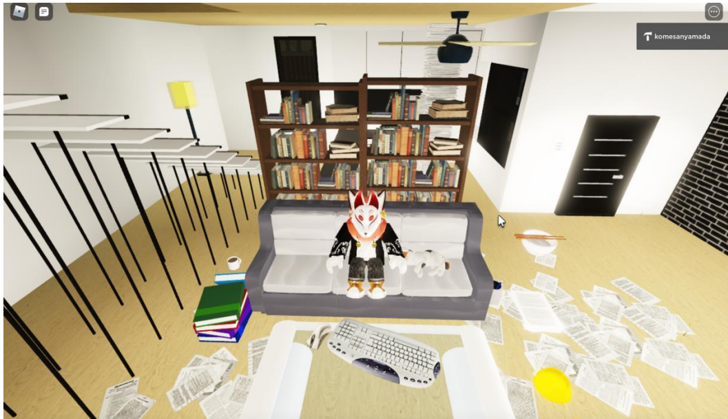
Figure 8: Working from Home

Fox hated the bookshelves they had moved to the living space to act as a zoom backdrop. They felt like a constant reminder that their life was full of the wrong type of reading.