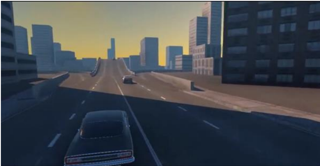
Figure 4: Leaving the City in search of a Lost Partner

In this vein, automated vehicles are present within the scenography of Queer Psycho , exerting an uncanny force, following the player-driver and swerving to avoid collisions, their presence is partly surveillant, partly supernatural, alter egos shadowing the protagonist. These vehicles are also engaged