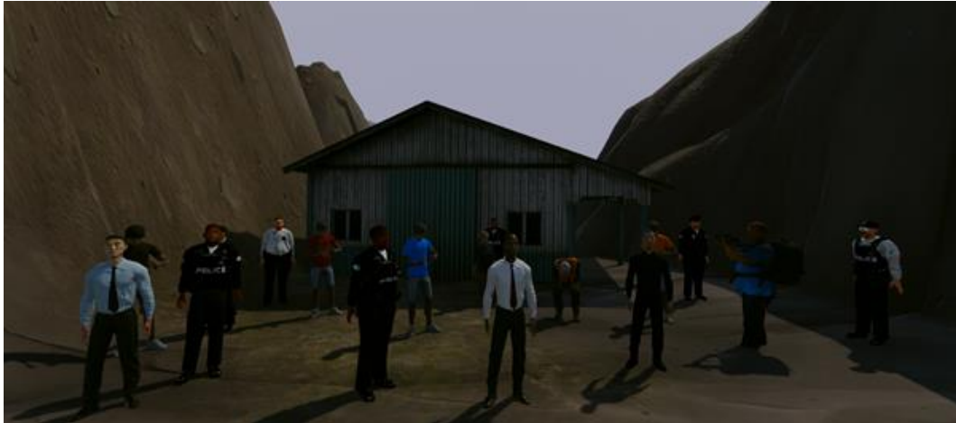
Figure 3: The Final Chorus of Lost Queer Characters

To highlight the presence of a neoliberalised immersive emotional economy Queer Psycho provides signposts, literal and metaphorical, pointing to the presence of immersive technologies. The presence of a fulfilment centre also points to the often-hidden labour or ‘Ghost Work’ (Gray & Suri, 2019) of digital interaction, in keeping with Alston (2016), who states: ‘neoliberalism in a post-industrial era valorises immaterial forms of production and consumption that are based on the psychological and physiological capabilities of producers and consumers’ (p. 24). The signposts are designed to prompt as Alston (2016) urges us to reflect ‘on the terms and nature of an audience’s productivity and its attachment to certain kinds of participatory freedom that may not be as free as they first appear’ (p. 25). Splitting up the terrain of Queer Psycho and loading it when player-drivers approach a particular region, makes for both a more efficient management of the open world, but the visibility of the process also creates an explicit sense of scene change. Such scene changes become visible to the audience as the software catches up with the player-driver.