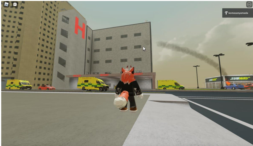
Figure 9: What Pandemic?

After leaving the University, fox was struck by the ambulances lined up outside the local hospital, and was reminded that the end of pandemic restrictions was merely gaslighting. Fox wished they had work a mask at work (Figure 9).