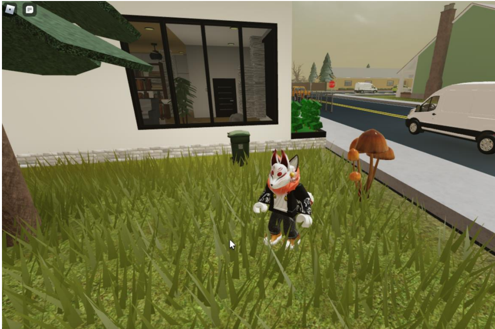
Figure 10: More-than-Human Possibilities

Fox was lightened by the appearance of fungi around the city.