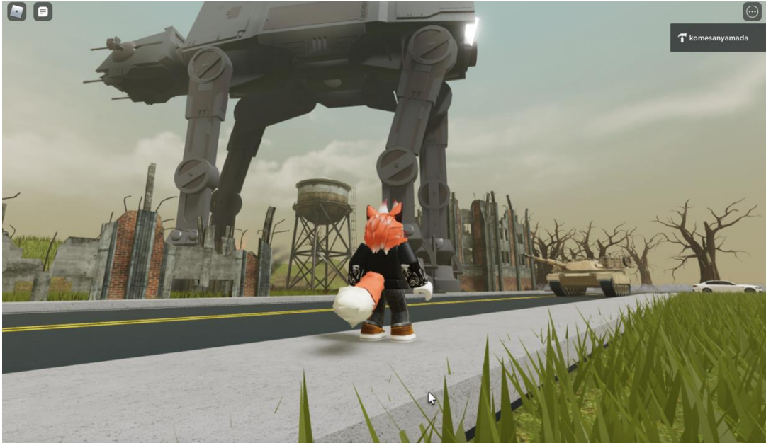
Figure 6: An AT-AT in the city

The AT-AT could symbolise any number of big world events. Further, the use of the AT-AT relates to “misdirection” (Fujii, 2020) in so far as it draws the user-player into the scene through the use of a familiar character. It is only on closer inspection that it can be seen to represent other events in the world and the player is provoked to think about this by the positioning of the AT-AT close by the in-game University.