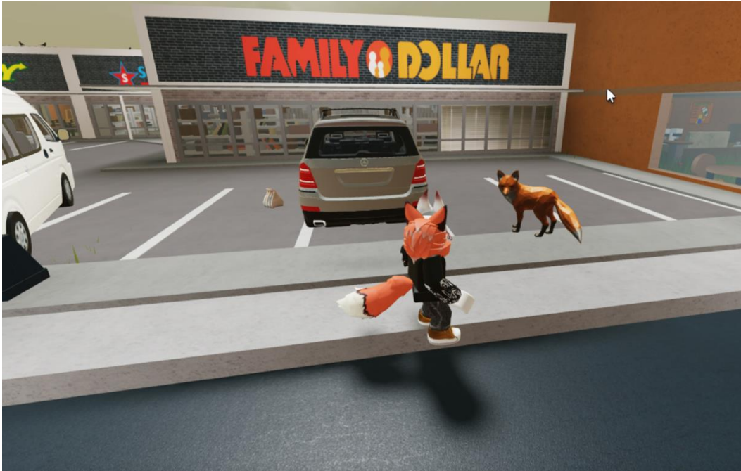
Figure 5: Academic Fox meets Urban Fox

Groot (1997) writes about changes to academic roles as a result of the marketisation of Universities from the 1980s onwards and the effects this has on their wellbeing: