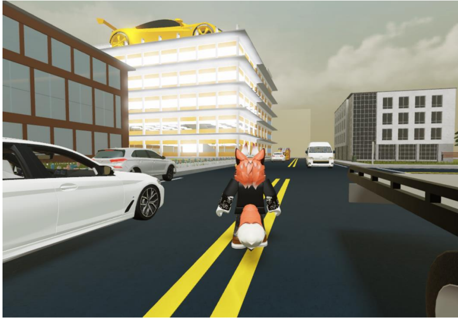
Figure 7: The student experience carpark