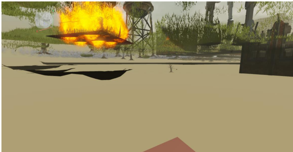
Figure 11: The Underside

Author B returned to the developer area of HE Circus and travelled under the world she had created and looked up imagining the reverse of what Sheldrake was seeing in his search for fungi on roots (Figure 11).