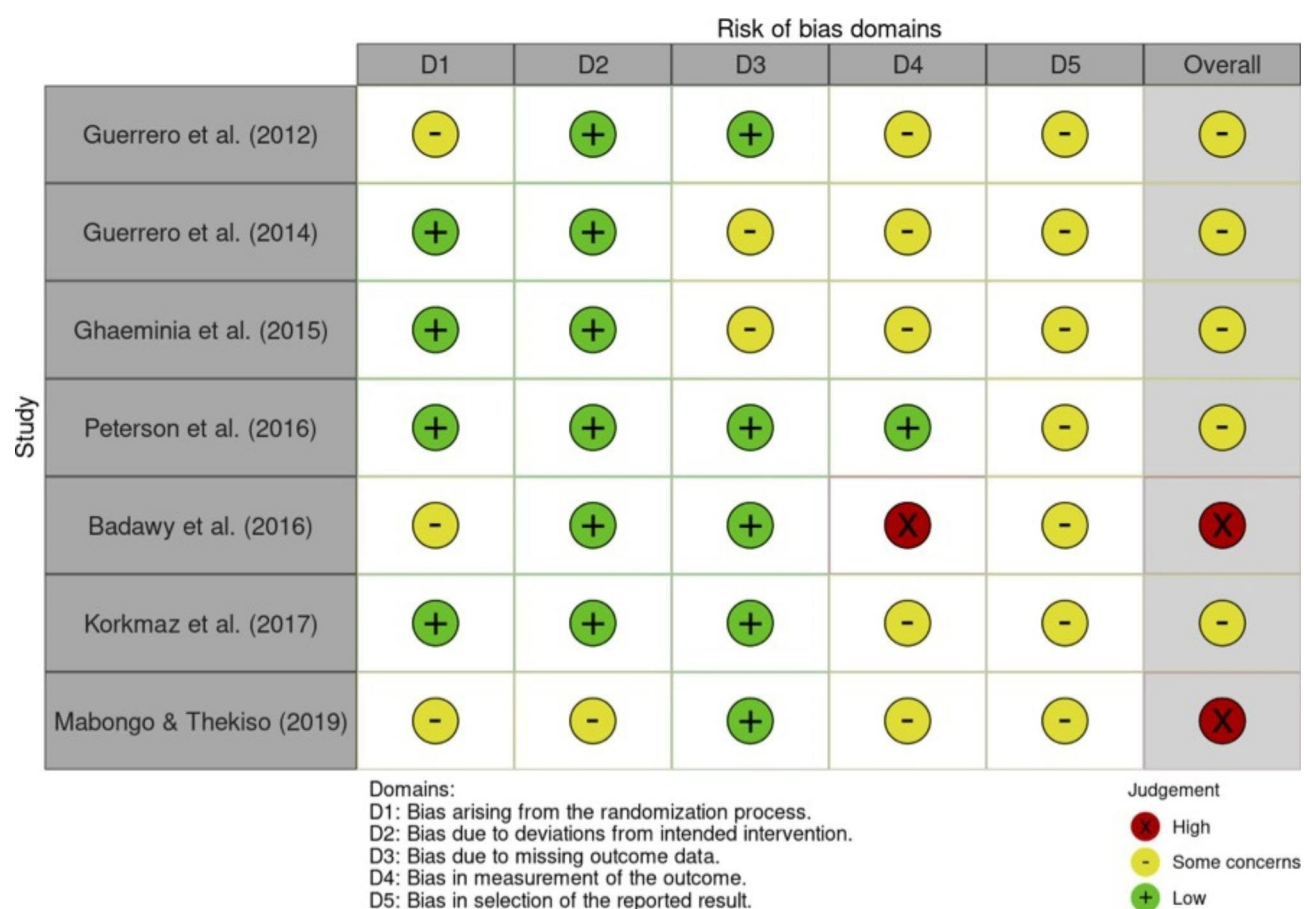
Fig. 2 Summary of risk of bias assessment for each study by domain and overall judgement (Primary outcome- Nerve injury). D=Domain.

MTM=Mandibular Third Molar, OPG=Orthopantomogram, CBCT=Cone-beam Computed Tomography, * = significant result