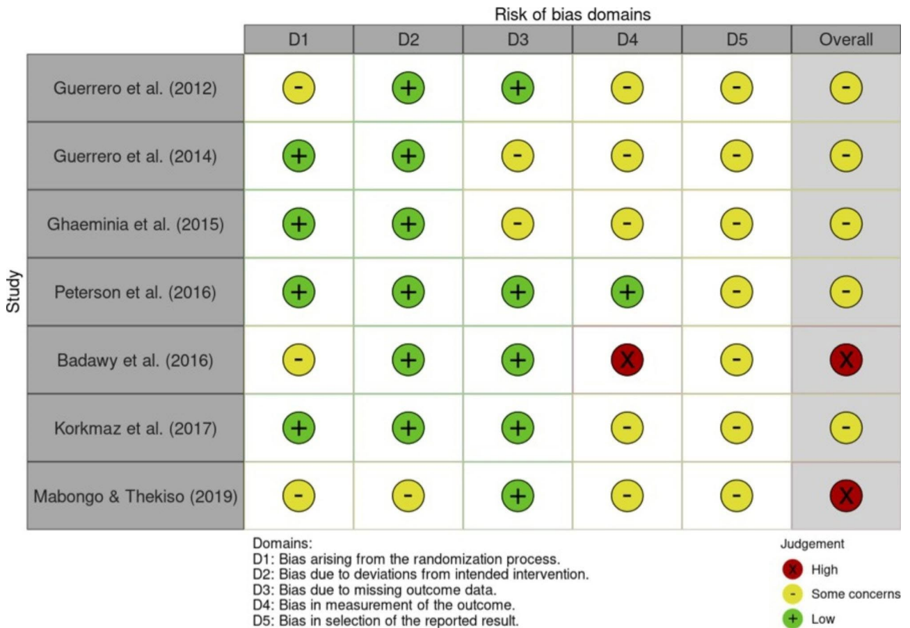
Fig. 2 Summary of risk of bias assessment for each study by domain and overall judgement (Primary outcome- Nerve injury). D=Domain.

MTM=Mandibular Third Molar, OPG=Orthopantomogram, CBCT=Cone-beam Computed Tomography, * = significant result