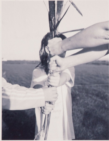
Hand holding reeds The reeds are used to make paper