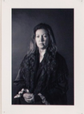
Hand holding reeds The reeds are used to make paper