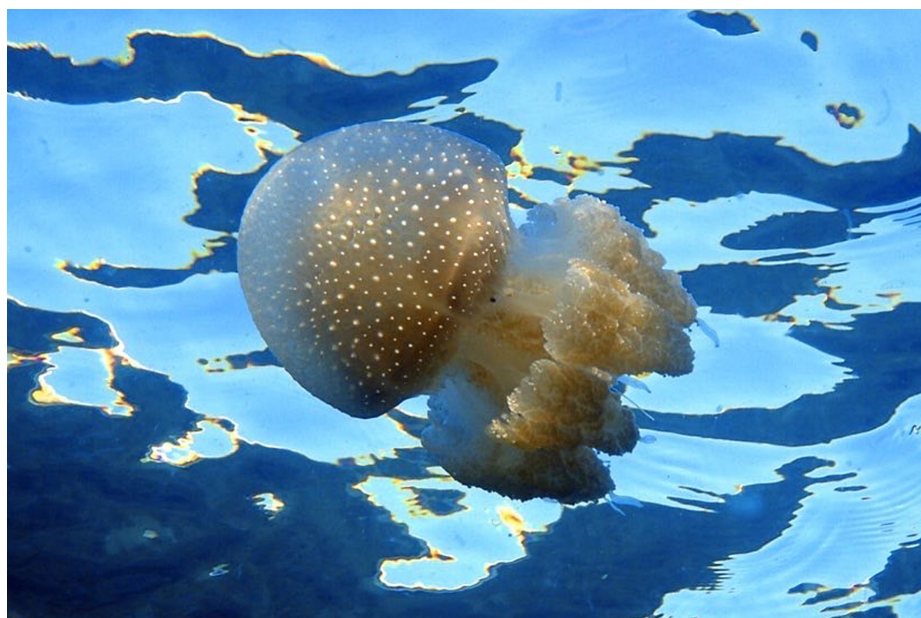
Figure 1. Phyllorhiza punctata from Da Costa Bay (Cyprus, eastern Mediterranean Sea).