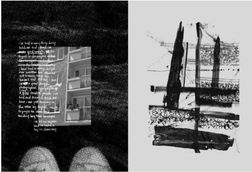
Self-reflection (2021) Message Covid-19 Special issue © Hedzlynn Kamaruzzaman Plymouth, UK

communicators' have contributed, for example, inspiring and capturing new ways of teaching and learning; reaching out and collaborating with communities; seeking solace in practice to provide comfort to themselves and others.