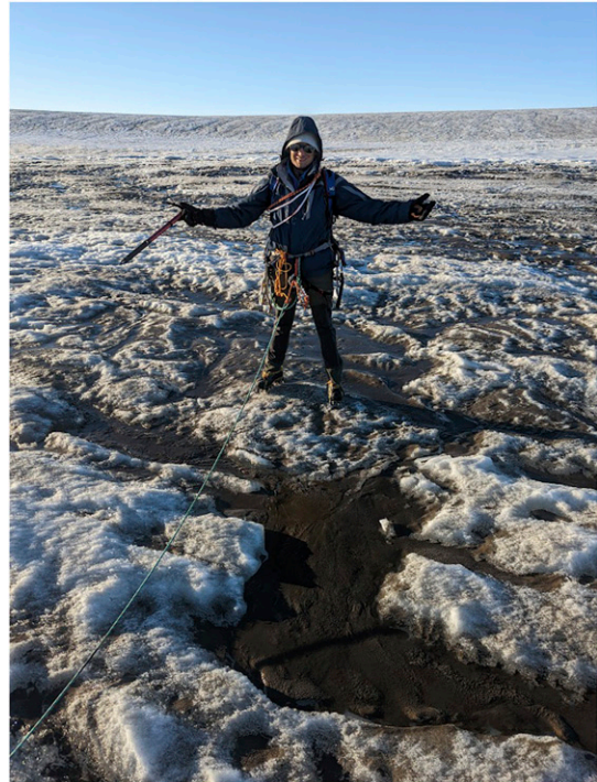
Figure 1. An example of mass sediment (cryoconite) storage on the surface of the Flade Isblink ice cap, Greenland. For interpretation of the references to colours in this figure legend, refer to the online version of this article.

Furthermore, the sediment itself can also be seen as a contaminant for many communities and industries (CCME, 2002; Chapman et al., 2013), as it can require management, monitoring and removal. Ice surface materials, such as cryoconite (Beard et al., 2022), can be easily mobilised by supraglacial meltwater, resulting in the potential for contaminants sorbed onto particles to enter the downstream hydrological system. Some ice surfaces (e.g. flat ice caps) store much larger quantities of sediment (Figure 1) than steeper valley glaciers.