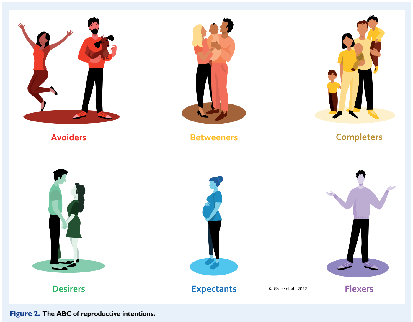
Figure 2. The ABC of reproductive intentions.

graduates and non-graduates. They felt that the timing was important in order to try for a baby. In order to plan for pregnancy, they were talking to their healthcare professionals, taking the right vitamins, taking care of their health, and timing conception to maximize chances.