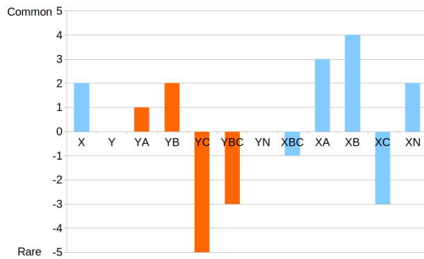
FIGURE 1: Informal example of the context explanation of the COFED. Blue bars represent associative strengths for stimuli where the training context cue (X) is present. Orange bars represent associative strengths for cues where a novel context cue (Y) is present. The values on the y-axis represent arbitrary associative weights for the two outcomes.

recently been replicated by (Inkster, 2019, Exp. 3). We refer to the co-occurrence of the IBRE and this response pattern as the COMpound versus FEatures Dissociation (COFED). We describe the effect as a dissociation because the response to the compound BC is opposite to what one would expect from the summation of the responses to the individual cues.