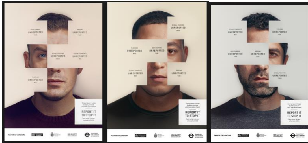
Figure 2. Still images from the 'Every Report Builds a Picture' campaign