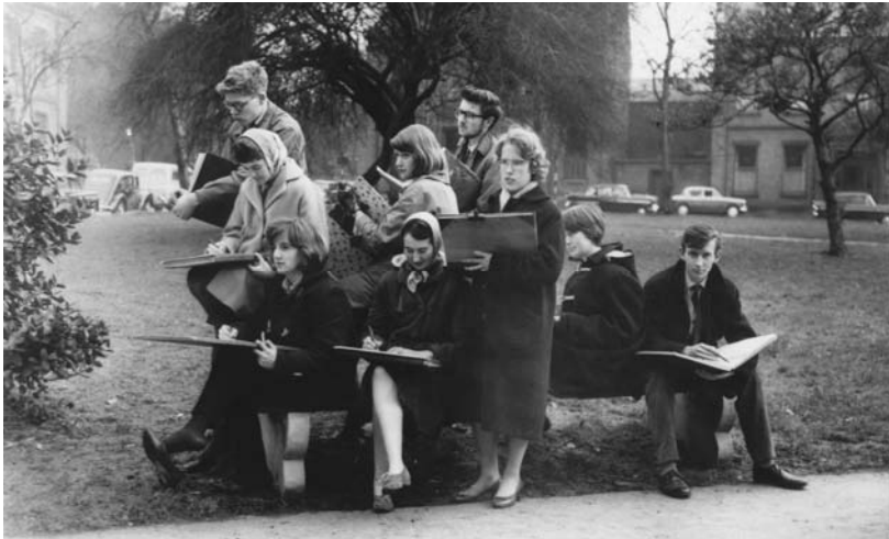
Fig. 1-2. Harris Art School.

I was a student at the Harris Art School in Avenham Lane, Preston from 1959 to 1961. We were sent out sketching in Preston, and we usually did a minimum of work. I remember when we were told to go to the docks to sketch, we hid underneath some empty goods wagons, peering out between the wheels, until we saw our tutor's legs go past. Then knowing that the coast was clear, we simply explored the docks for a while. He never did find us.