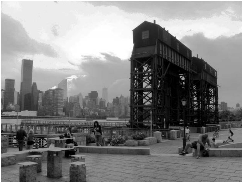
Fig. 5-2. Gantry Plaza Park, Queens, near 48 th St., photo by author, 2012

Hunters Point is the first stop in Queens on the No. 7 subway line. To better appreciate the area's past, walk north from the Vernon Boulevard station to 48 th Avenue. Here, the street is wider than most because it once accommodated below-grade train tracks that divided the neighborhood and connected the waterfront to the Pennsylvania (Sunnyside) Railroad Yards. Filled in 1994, this reclaimed area opened as Hunters Point Community Park in 1995. Approaching the East River, float bridges or gantries become visible (Fig. 5-2). Like the figurative bronze sculptures that punctuate the paths of 19 th century parks, these large steel structures speak directly of past successes and human deeds. Painted black, orange letters boldly spell out the words "LONG ISLAND," recalling the trains that once served passengers here, as well as the park's geographic location (Gray 2004: RE10; Dunlap 1994: 454).