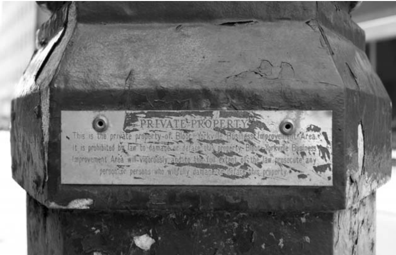
Figure 4-3. Plaque on Designer Light Pole, Yorkville

Coinciding with the postering issue, the Bloor-Yorkville BIA was initiating a multi-million dollar street transformation project; as noted by urban affairs columnist, Christopher Hume, this project could “only go so far without bylaw changes” (2003). “There are million dollar stores on Bloor Street, but not a million dollar streetscape” (de Lange 2003), complained the same spokesperson we heard from previously. While unsuccessful, revealing attempts were also made by the BIA to forbid hot-dog vending and panhandling from Yorkville streets. Mobile and nomadic, such activities legitimate uses of streets as embodied places in which to dwell, pause, eat, and possibly engage with strangers (Sennett 1994). In this way, they disrupt the image of the area as an enclave for “high-end” consumption and place of virtuously productive, i.e. capital generating, activity.