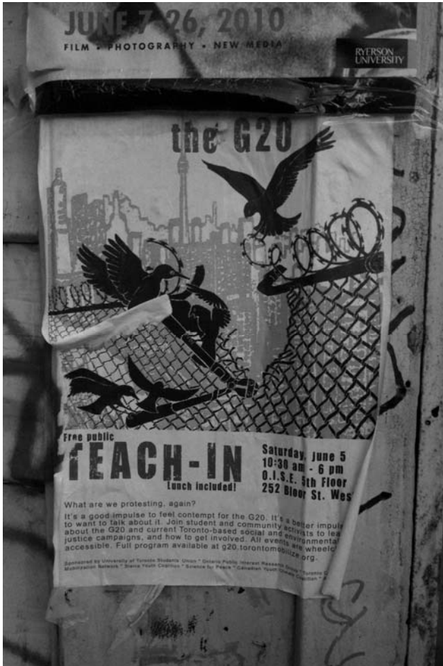
Figure 4-5. G20 Teach-In Poster, College Street

that it brought to public surface—had an impact on this outcome. True, many of the provisions from the original bylaw proposal were retained, including a controversial requirement that contact information be inscribed on the poster text. But by institutionalizing the category “community” poster, forms of expression that could be seen and said to emanate from within the collectivity (the city) were softly sanctified.