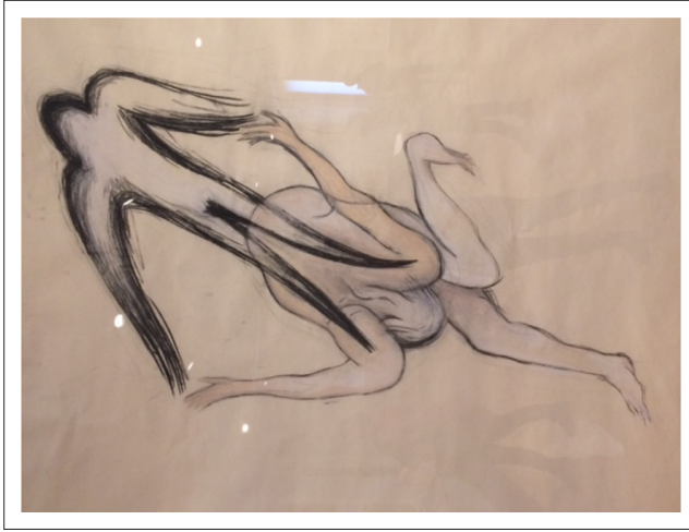
Figure 1. Photograph by Gaia Del Negro of drawing by Birgit Jürgenssen, (thought to be Untitled , 1983) at I AM exhibition in Bergamo, 5 visited March 19, 2019.

vulnerable beginning, we develop a sense of ourselves, our subjectivity, always and only through relationally configured developmental processes (Stern, 1985).