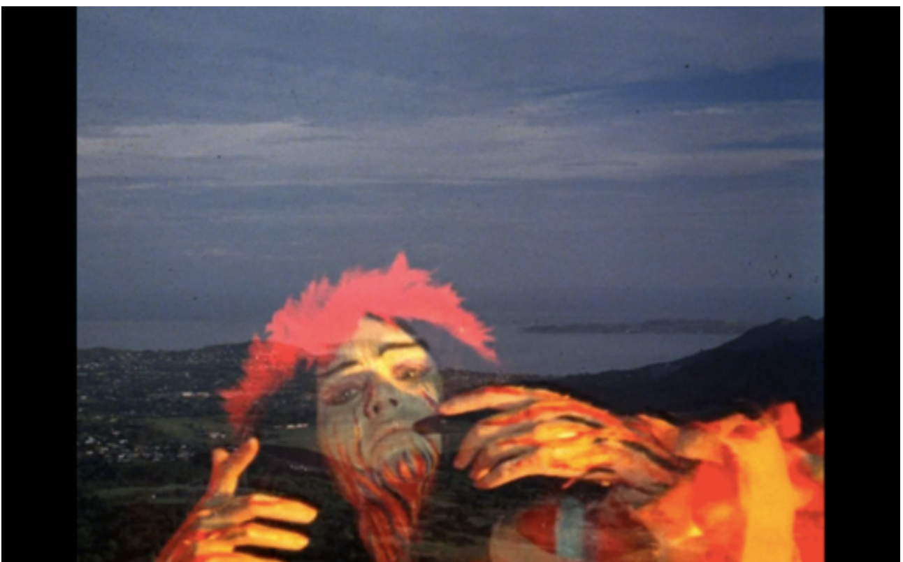
Image 6 - Pele appears to Sam Kalakua. We later learn this is actually his niece in face paint.