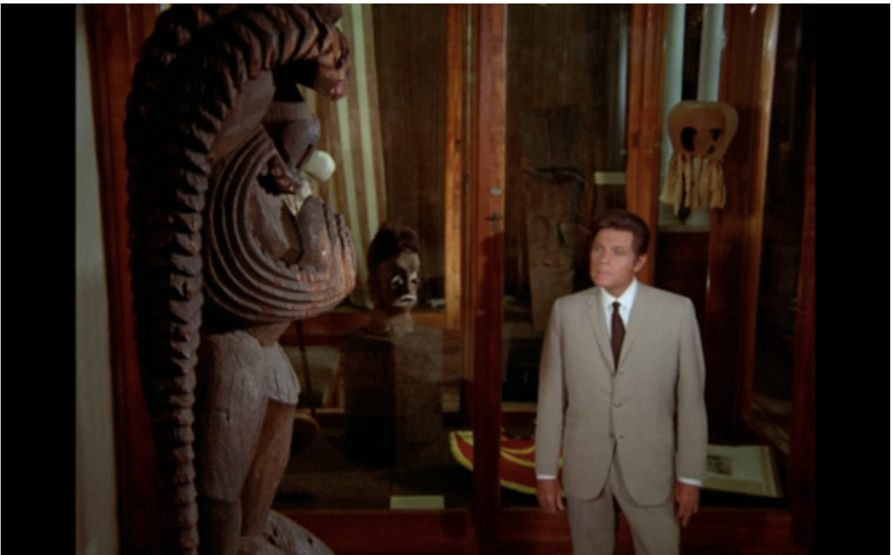
Image 2 - McGarrett considering the full body bust of Kū.