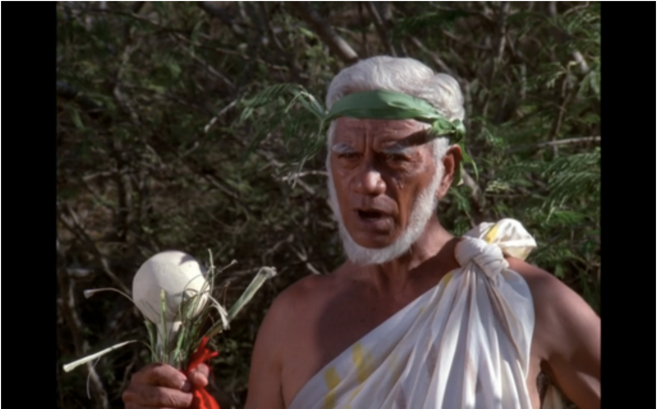
Image 5 - The Kahuna accosts Detective Truck Kealoha. He is wearing a headdress made out of ti leaves and a kīhei .