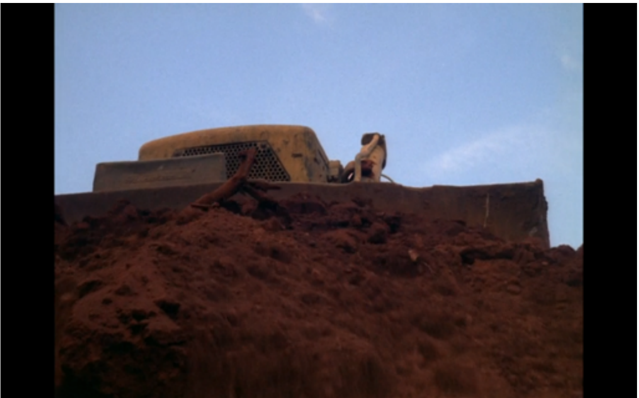
Image 4 - Bulldozer shovelling dirt as if to bury the camera.