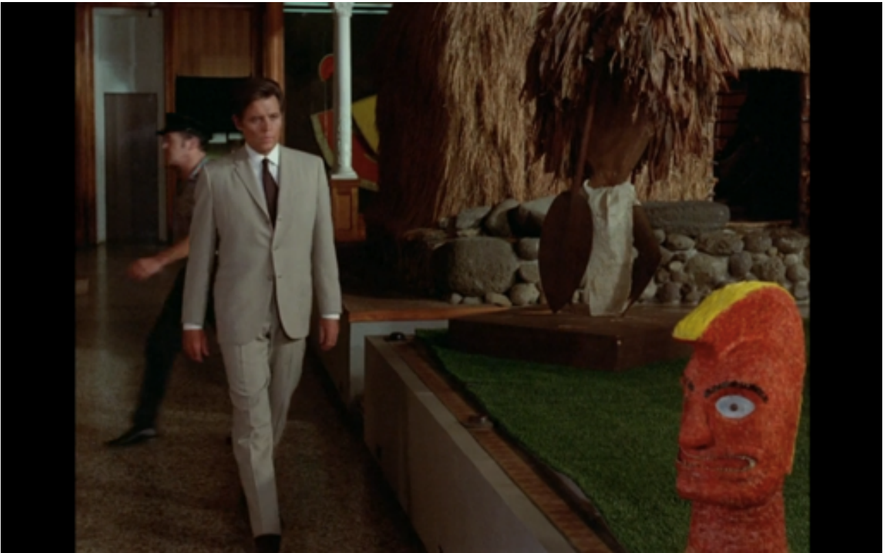
Image 3 - McGarrett and the feathered bust of Kū.