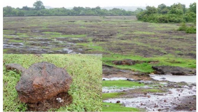
Figure 2. Rocky plateau habitat near Dhamapur comprising lateritic rock ground with sparse woody vegetation, scattered loose lateritic rocks, shallow soil depressions, temporary streams and pools. Insert: rock partially lifted to reveal A. stolatum eggs.

Previous observations by Wall (1925) recorded eggs of the species successfully hatching in a garden in Rangoon confirming that this snake will use semi-natural nesting sites. Our observation suggests that this unusual choice of deposition among lateritic rock by A. stolatum may be influenced by seasonality (wet season rains), prey availability (amphibians/tadpole in temporary pools), and/or suitable foraging habitat. We also speculate that in this instance the snakes concerned may have chosen to lay eggs in an area with immediate prey availability in preference over traditional substrate as a way of potentially improving offspring survival.