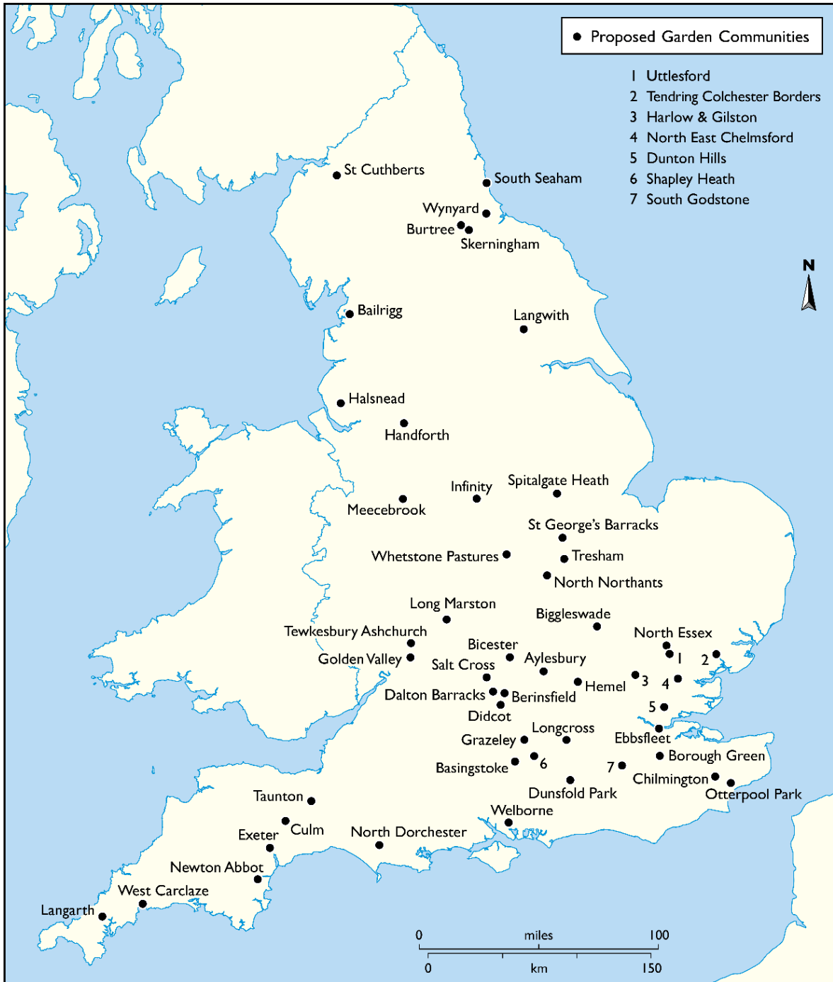
Figure 3: Location of the proposed garden communities in October 2020 (England)