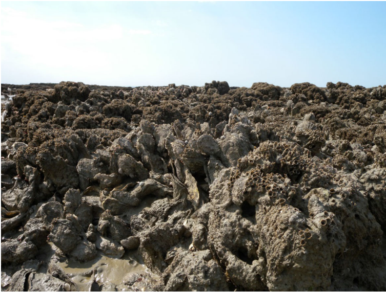
Fig. 3 Wild settlement of C. gigas on reef of Sabellaria alveolata . Bay of Mont-Saint Michel (France) (Photo: N. Desroy)

with high settlement of wild C. gigas (Markert et al. 2010), yet increasingly unsuitable habitat chemistry and anoxia associated with high rates of decomposition of biodeposits and microbial respiration is likely to be responsible for the suppression of species diversity at very high levels of C. gigas cover (Green et al. 2012; Green and Crowe 2013, 2014). Due to a sediment-free upper part of the reef and more turbulent current flow, species richness was significantly greater amongst the oyster beds compared to mussels and some faunal species were exclusively found on oyster beds, particularly anemones and suspension feeders (Markert et al. 2010). Higher species survival amongst the more complex oyster reef structure and bio-deposition of sediments was also thought to explain differences in species richness (Kochmann et al. 2008).