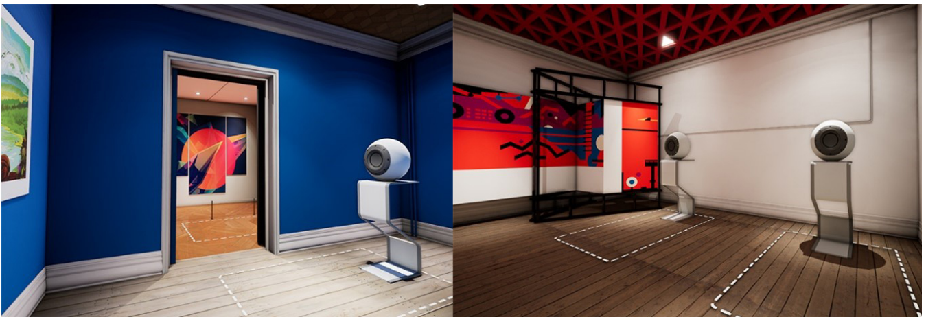
Figure 1: (Left) Image of the two-room (2R) condition. Speaker is on the right of the image and doorway in the centre with view of second room. (Right) Image of one-room (1R) condition. Both speakers are placed within one room