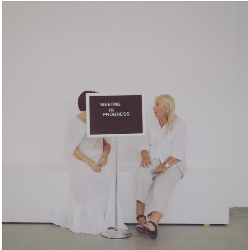
Figure 20, Meeting in Progress I, Temor , April 2016

Meeting in Progress I, Temor (April 2017, figure 20, https://vimeo.com/219289746 ) was the second exploration with my mother. We found a small sign board that said, “meeting in progress” (in Ella y yo this same sign was present, but it was in this piece that the sign participated more actively). I brought this sign into the frame because it was in the room in that particular and appropriate moment. Although I could have discarded it, I realized that it was a non-human participant, that was there as part of the environment and I recognized it as I was dérive-ing . Even though there were more objects in the room, this one became a participant because there was a relation between it and me. When I looked at it, it sparked my imagination inspiring me to make something with it. If that sparkle would have happened with other objects, they would have become participants as well, but on that particular day at that particular moment, it was only this small sign. Something similar happens with people. Some people decide to participate because they connect to something, an object or a person that will be part of the exploration. Sometimes some people remain sitting as observers rather than participants. Some people even leave and do not observe, and it is similar with objects. In terms of the sign’s form and its content, it was what gave a starting point to our piece in which