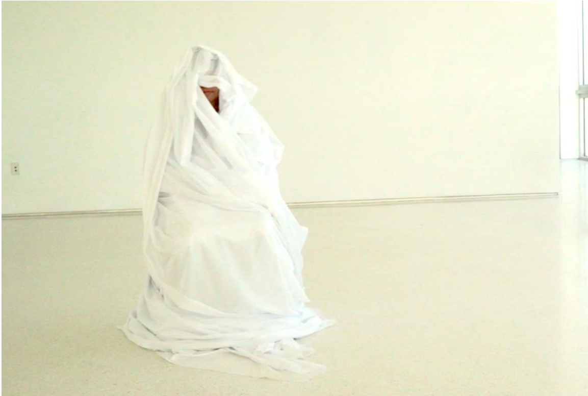
Figure 12, Metamorphoses , North Beach Senior Centre November, 2015