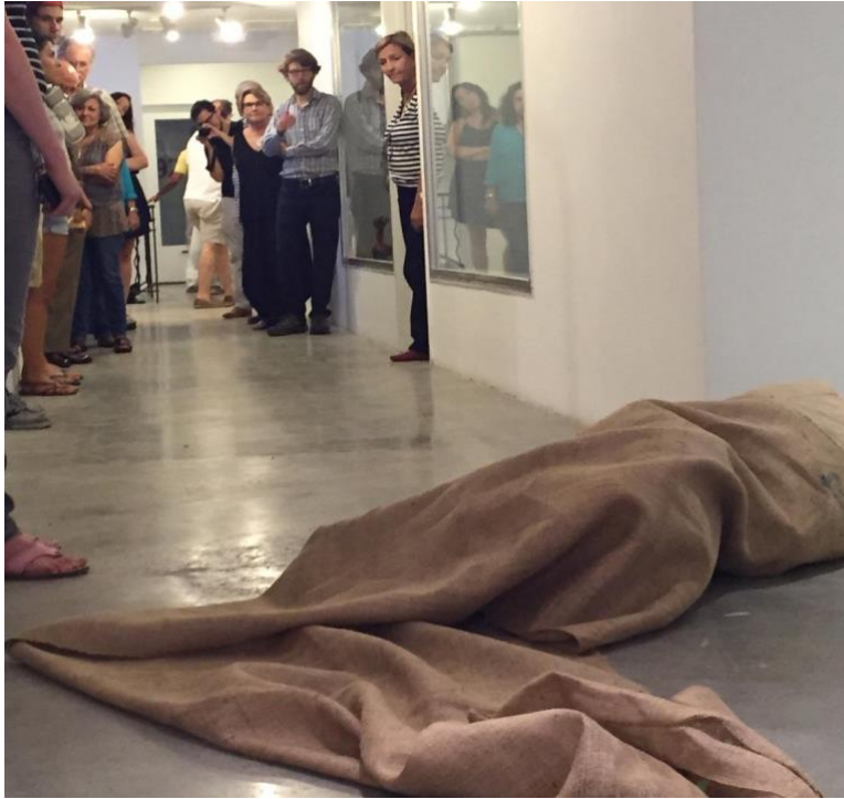
Figure 2, Action I , September 2015

In 2015, I began to conduct performative work through my first action, Action I (September 2015, figure # 2), in which I wrapped my body in a roll of burlap and then unwrapped myself. During the action I did this gesture of unwrapping and wrapping three times and then left. (The by-product video can be viewed on my vimeo page at https://vimeo.com/138980725 .) I needed this chaotic transformation at that time to break through from the inside of my studio to the outside space. Through my use of raw material, the action embodied the formation of thought as the material for the sculpture, and the sculpture embodied the idea built with the thought (Beuys). Joseph Beuys believed that process was the object of his work. In his process, everything is in constant change, which provokes thoughts and stimulates transformation and evolution, thereby shaping thoughts as well as the world.