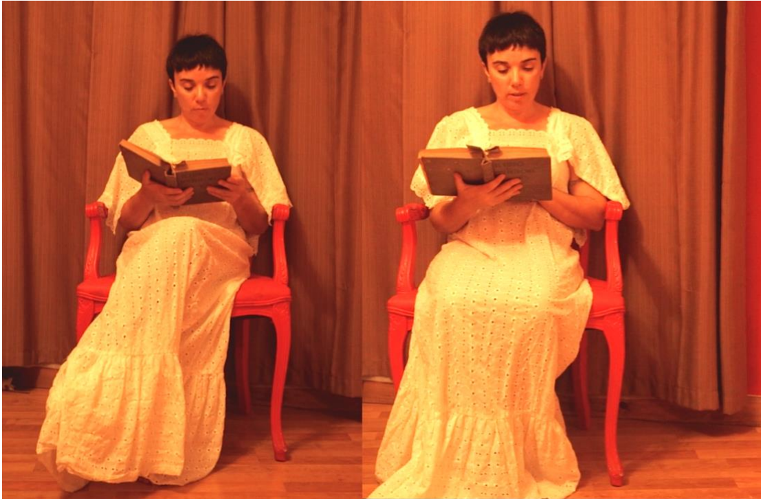
Figure 10, The Tower , November- December 2015

Broderie anglaise is the name of the fabric of the dress I wore in this piece and in many other pieces that will come later in this research project. In 2004 - 2005 I was living in a small apartment in the Miami Biscayne Bay area when a neighbor knocked on my door one day and gave me a bag with dresses from her thrift store that were not salable and she thought would be perfect for me. I used them for a series of self-portraits. The time passed and I lost the dresses during moving, clean ups, except for one with which I felt connected from that day until now. The white broderie anglaise that makes up this dress (or nightgown) has connections in my memory of the dress made by my nonna for my communion. It is not the communion that is memorable, it is the fabric and the Necchi sewing machine with the wheel and the pedal that came with my nonna and my mother across the Atlantic Ocean and made it from the Italian Alps to Buenos Aires. The smell and the sound, the broderie anglaise in my inner world connects me to that moment and to many moments, to her home, her language and her stories.