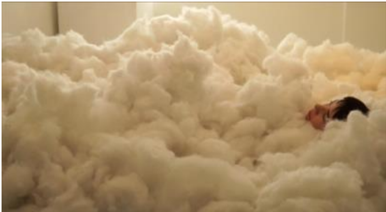
Figure 9, El juego , ACSF, October 2015

was going to bring new problems related to liberties. In the building one must follow institutional rules and regulations and power relations. Through this embodiment, I copied, with a sensorial approach, an environment that I inhabited yet ignored every day. Those actions led me to the awareness of the environment as a participant, but a new question arose: did I want the Institution to be a participant? I did want the building, as any environment to be a participant, yet I rejected the Institutional power. The institution is not a free environment. It has policies that do not always make sense to me, especially when the building belongs to an art center that looks for new artists, and artistic ideas, but they cannot offer a space of freedom to work due to insurance policies, board members views, and so forth, that they must enforce. Later in this research, I conceive of the camera assemblage as a cluster of elements which includes the institution as one more non-human participant. (Chapter 5)