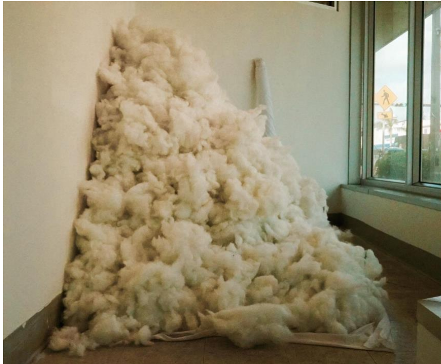
Figure 7, Memories II, his memories , October 2015

Through this action I was not only connected to my inner need to undo my traditional work with a performative action; I also felt I was becoming more honest in my practice. I was exposing the inside material—the unseen, the hidden, that which gave volume to the sculptures so that they occupied a space with a specific form. The volume makes the form come to existence. The main material that shaped it was now outside, visible and tangible. Martin Heidegger writes in a poetic way, how the piece is within the material: