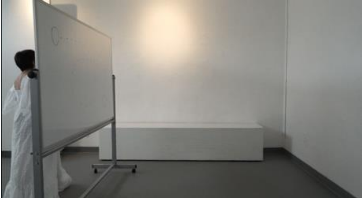
Figure 25 Pizarra Blanca , April 2017