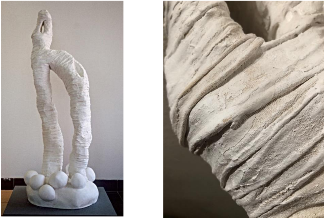
Figure 3 & 4 Untitled , 2004, Detail

The gesture of wrapping things with fabrics, wire or paper was part of my practice for a long time. The tale of Tartars wrapping Joseph Beuys in felt and fat to keep him warm probably marks the beginning of his practice, as all his life he carried on using those materials. The wrapping as a metaphor of care, as containment, in his case, and to frame his theories.