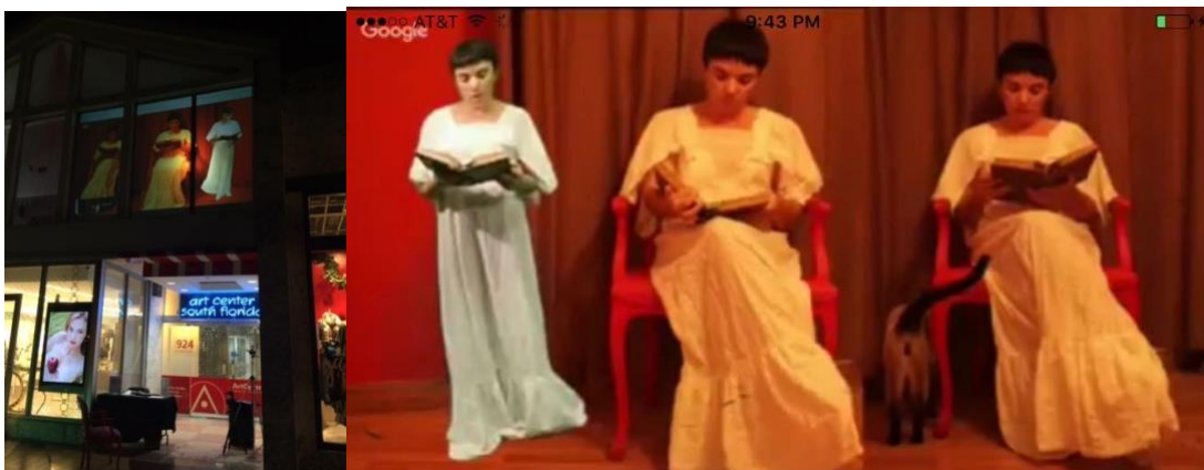
Figure 11, The Tower , Images of Miami beach Art Basel week, December 2015