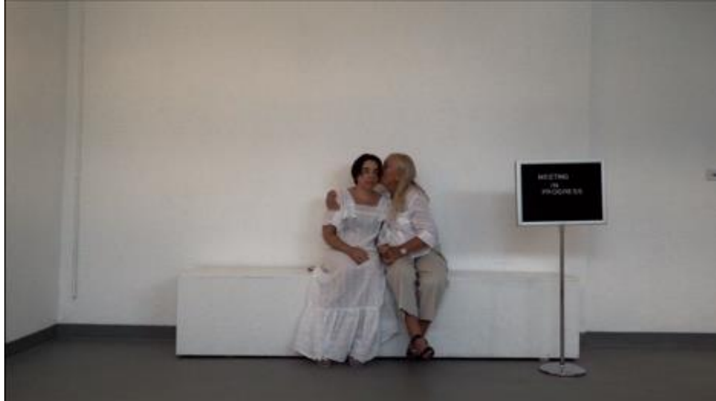
Figure 19, Ella y Yo , ACSF, March 2017