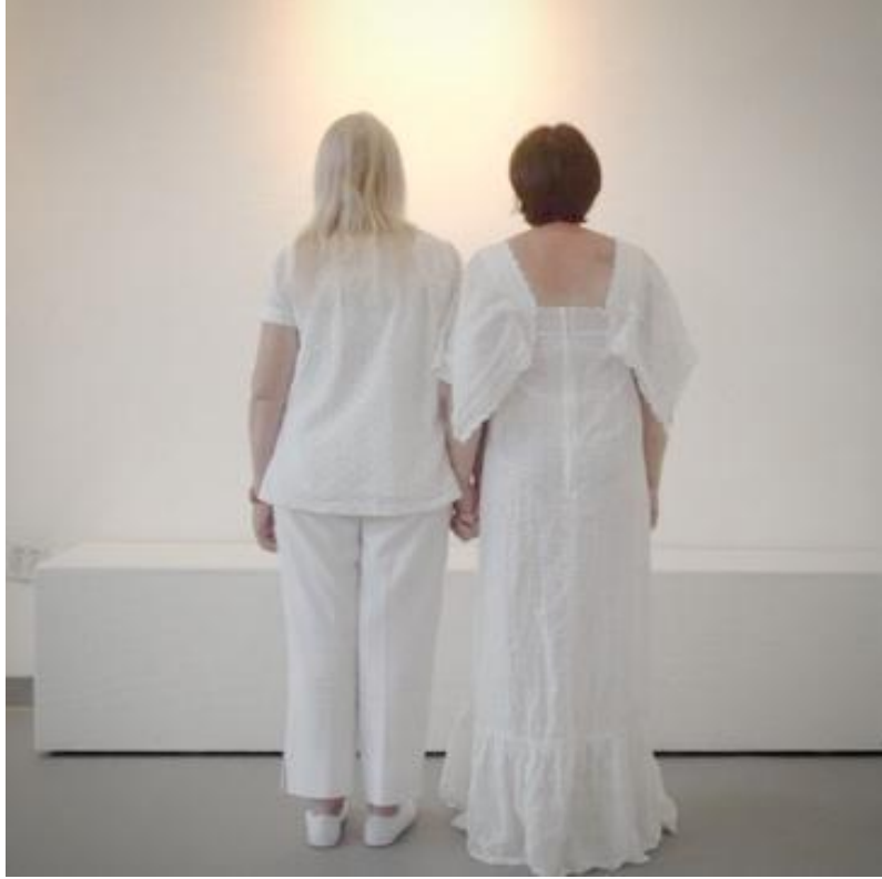
Figure 21, Meeting in Progress II , March 2017

Meeting in Progress II , April 2017, (figure 21 https://vimeo.com/213439845 ) is the result of the calm connectedness between my mother and me. The silence itself opened a space for us to become connected. The fact that we had our backs to the camera allowed us to be more sensitive to what was happening within us. Without words, the transformative SSE continued in silence or more accurately continued with us without talking, as there were lots of sounds in the building or coming from the street. We became aware of and connected with sounds and the environment through our bodies and that allowed us to be connected. We were an assemblage with all that surrounded us and all that was within us. There were movements between body organs, sensorial connections with feelings mixed with pieces of memories. There was a sense of chaos, and that seemed to be the way it should be, but that chaotic mix is extremely difficult to articulate in writing. As regards some of the things that happened, I do not even have a name or a word to refer to them. Roland Barthes in Camera Lucida writes about a dream state that somehow explains this inexplicable and raw, uneditible mix of thoughts, memories and sensorial elements: