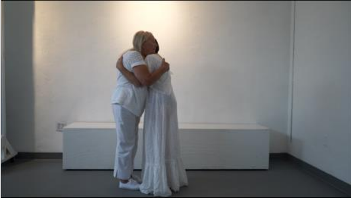
Figure 24, Transformation , April 2017

In Juntas (“ Together ”, figure 23 https://vimeo.com/219301790 and in Transformation , figure 24 https://vimeo.com/219298134 ), April 2017, it is clear that we are working together with the camera and the space. We are aware of this experience, we interrelated with the environment, the in-situ objects and the camera which determined the angle and the point of view “the other” would have. The camera’s recording/memory capacity gave us the ability to revisit that moment. The transformation and connectedness didn’t only happen between my mother and me but between her, me and all the non-human participants. Together and Transformation both became another moment that came naturally from within us as camera assemblages. They are the culmination of our experience. Where do I finish? Where does she begin? Is it important? The connection is all that matters, without line, only forms, changing forms, breathing forms, invisible materials connected.