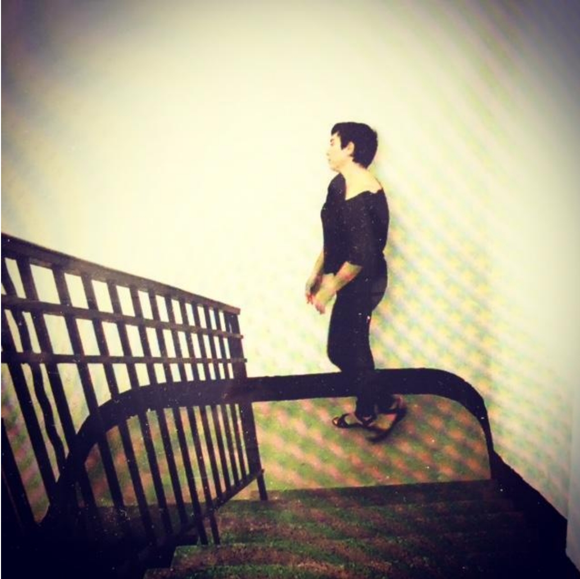
Figure 8 Embodying Space , ACSF October 2015

During that period, I was still in the beginning of my performance practice, and leaving the studio was an issue that I had to work with in order to break that space barrier. Richard Schechner states that, “one of the meanings of ‘to perform’ is to get things done according to a particular plan or scenario,” 105 and that is what I explored when I walked out of my studio with a plan of embodying the entire building in which my studio was contained. I followed the hallways that were traced through the design of the interior space of the building. These turned out to be more restrictive than my studio itself as now I had to follow Institutional rules as opposed to being the rule maker inside my studio. I realized that leaving the confines of my studio