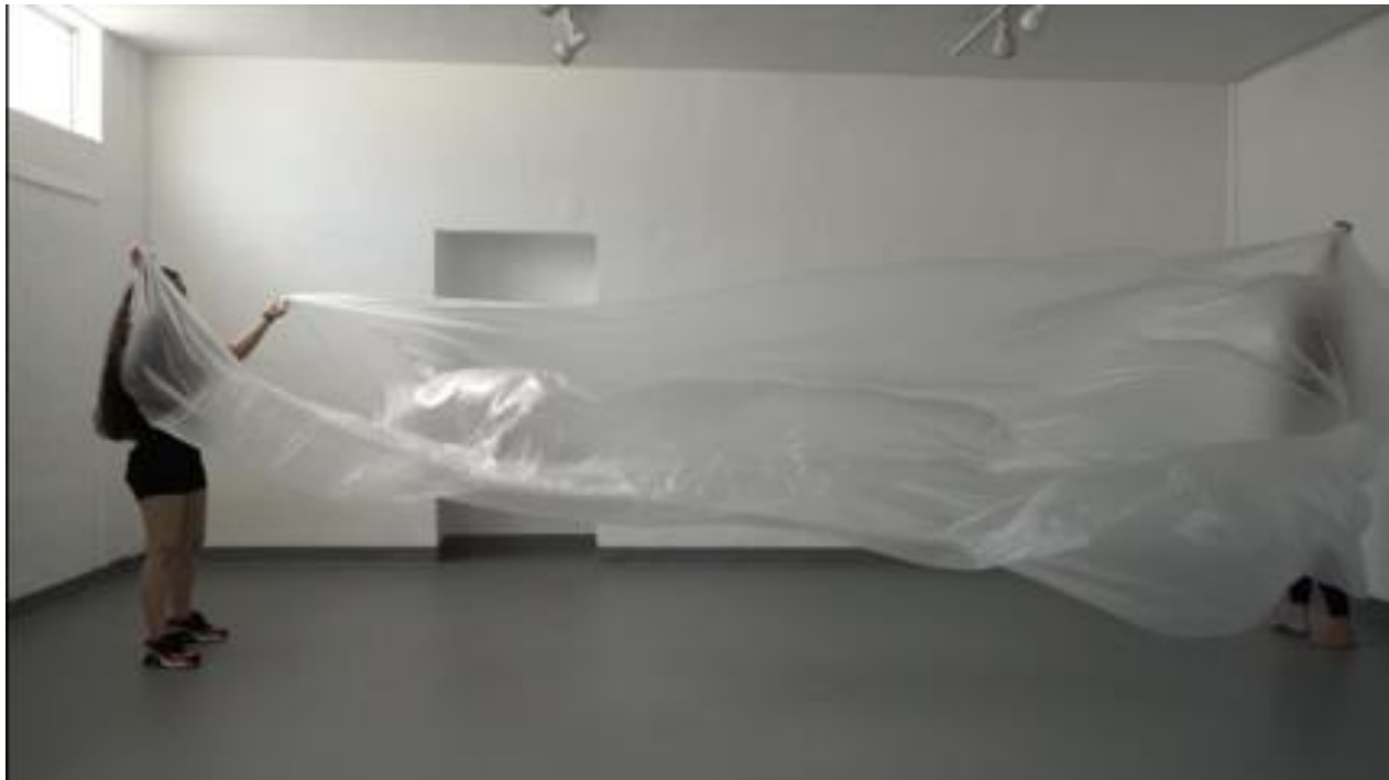
Figure 17: Plastic Waves , Eileen, May 2016

the camera's point of view. In the by-product Eileen described what we did. It has the sound of the plastic that we emphasized during editing as we both liked the noise of the plastic because it resonates with the noise of the ocean waves. The movement we were doing with the plastic, Eileen believed, was to pursue the sound of the plastic that made us move it as waves. The sound, as a non-human participant of the assemblage, directed us as human participants. In Plastic Waves I see the sound as a distinct participant as it is the only element over which we lose control. The sound dictated and controlled the movement we did with the plastic, not only during the SSE but also directed the decisions made during editing.