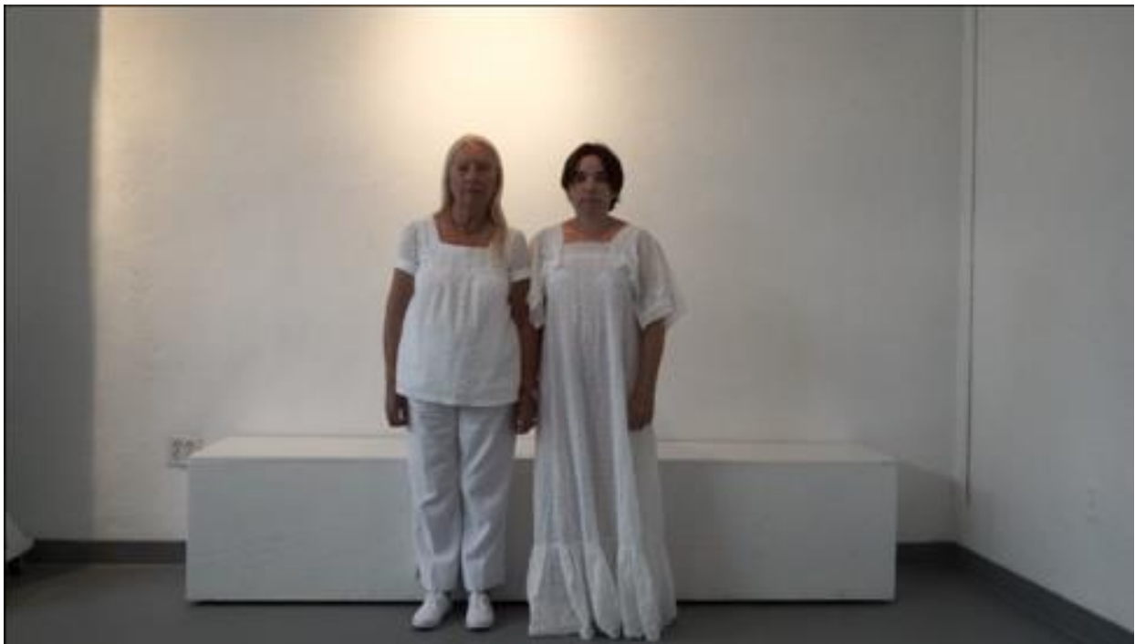
Figure 23, Juntas , April 2017

In Conectadas , April 2017, (figure 22 https://vimeo.com/219305054 ), we were able to create the atmosphere of silence and stillness which made us profoundly connected. Things came out in a wordless dialogue. We sat, and both of us were calm and connected to one another, acknowledging an inner space with no identity or center to hold on to. Being aware of the presence of the camera caused us to stay within its frame, the camera created the sense that it needed a slow pace, more time, and it was during that time that my mother and I connected, and at last I started sensing the camera assemblage. I cannot say that the camera had an intention, but I can say that its presence influenced my pace, it reminded me that I am there in that moment and space because I want to find something. I need to be aware of every detail with all my senses and that requires connectedness. In my work, the camera is a non-human participant that with its presence conditioned our process of connectedness, first through our being aware and somehow scared of the possibility of the judgment of “the other” through the camera, which made us uncomfortable. As the encounters went forward and we became more used to the camera’s presence, we slowly took more time for it (the camera became a participant), and this was when our process of inner connection took place.