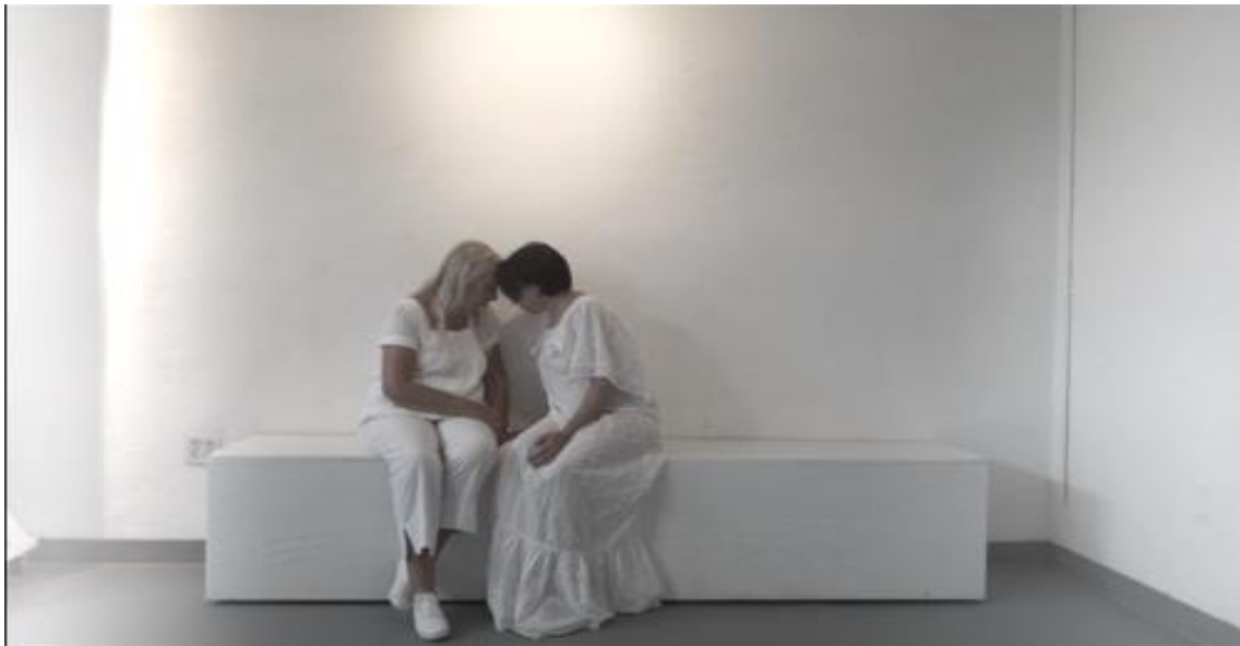
Figure 22, Conectadas , April 2017

Later when I was editing without my mother's presence, I experienced the 'Sisyphean labor' that Barthes refers to. I repeatedly watched the videos of the Explorations my mother and I had made and tried to produce a sentence that would describe what we had experienced, but every time I was about to, the stone rolled down and I had to start the work of climbing again. Finally, I realized that an unplanned secular ceremony was unexpectedly happening in our SSEs. There was only one repeated element, the clothing we were wearing. Together we were creating a ceremony, and that was all.