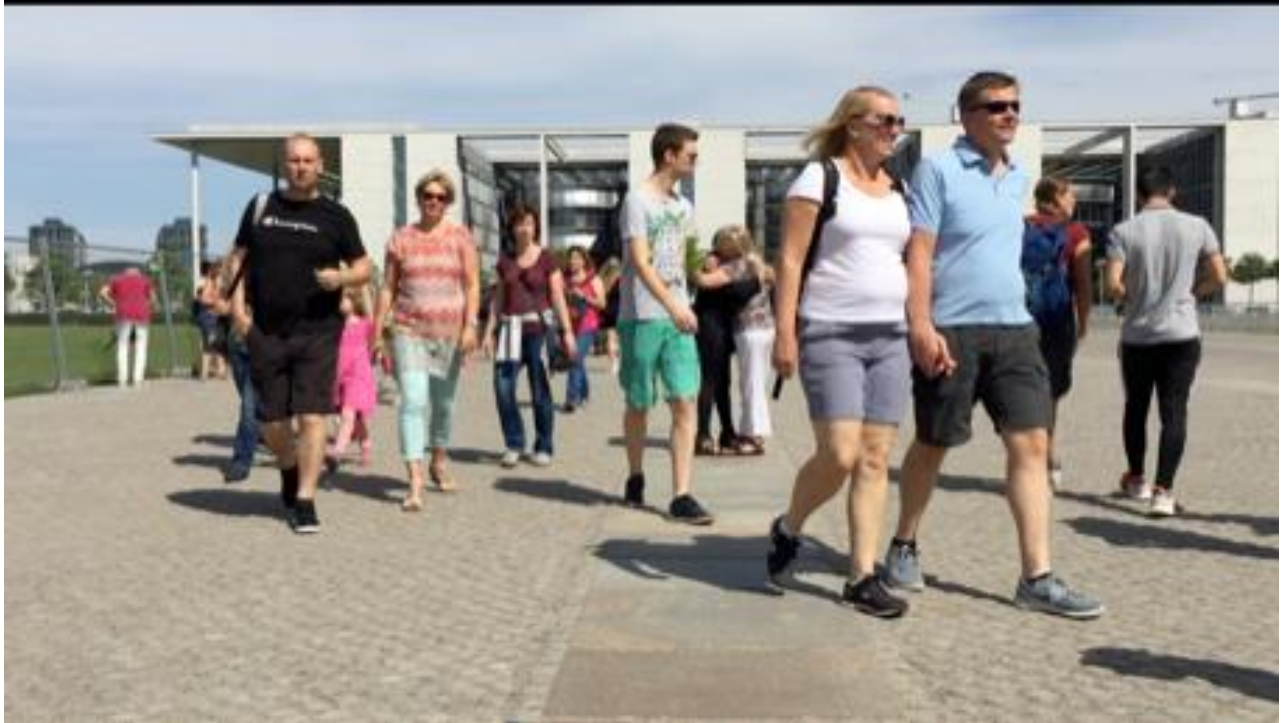
Figure 26, Un abrazo , Reichstag Berlin, August 2017

Un Abrazo , (figure 26, Berlin, https://vimeo.com/230335325 ) was made a few months after we finished the Miami Beach series of work. Doing it was much easier for both of us, and for me this was a confirmation of the transformative effects from the previous work, as we could connect immediately and in the middle of a busy street. This exploration was made in Berlin during rush hour at the Reichstag. The exercise of my mother and I hugging each other and being aware of and connected to the other's presence made an interesting contrast with the busy pedestrian street next to the Reichstag, where we were. The Reichstag an epitome of institution was behind us, surrounding us, yet we exercised our liberty, outside and in contrast to it. My mother and I hug, yet in this piece the Reichstag was also a participant as part of the cluster of the camera assemblage. The pedestrians, a mix of tourists and people on their work routine were juxtaposed with my mother and myself in silence, attached still bodies, aware of ourselves and our connection.