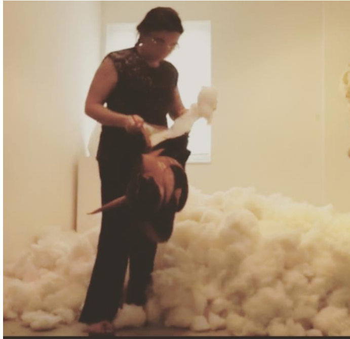
Figure 5, Colchonoero , ACSF, September 2015