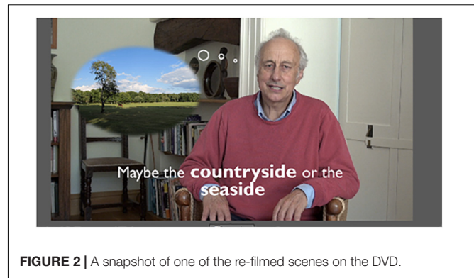
FIGURE 2 | A snapshot of one of the re-filmed scenes on the DVD.

Stroke survivors were recruited through 24 community stroke support groups in West Yorkshire and the West Midlands. CS attended the group meetings to introduce the study or sent the group leader a brief introduction to allow their members to contact her if they were interested in participating. The inclusion criteria required participants to: (1) have received a formal diagnosis of stroke; (2) have been discharged from hospital to live within the local community; (3) be aged 18 or over and;