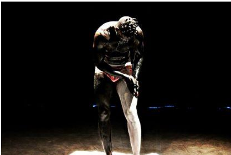
Figure 2.1: What Colour Do You See? Performance (2015)

comfortable? I concluded that white paint felt more comfortable due to it feeling like a protest within the landscape, the idea that I shouldn't be doing this, but I was, and doing so was challenging the treatment of the dominant culture in this location. By 'whiting up' I could show the white population what it feels like to be Black and how I've been treated. This paired with the issue that I was always told that I was "the whitest Black person" meaning that "blacking up" felt like I was losing my own whiteness and becoming fully subservient to the Black person that the dominant culture assigned me.