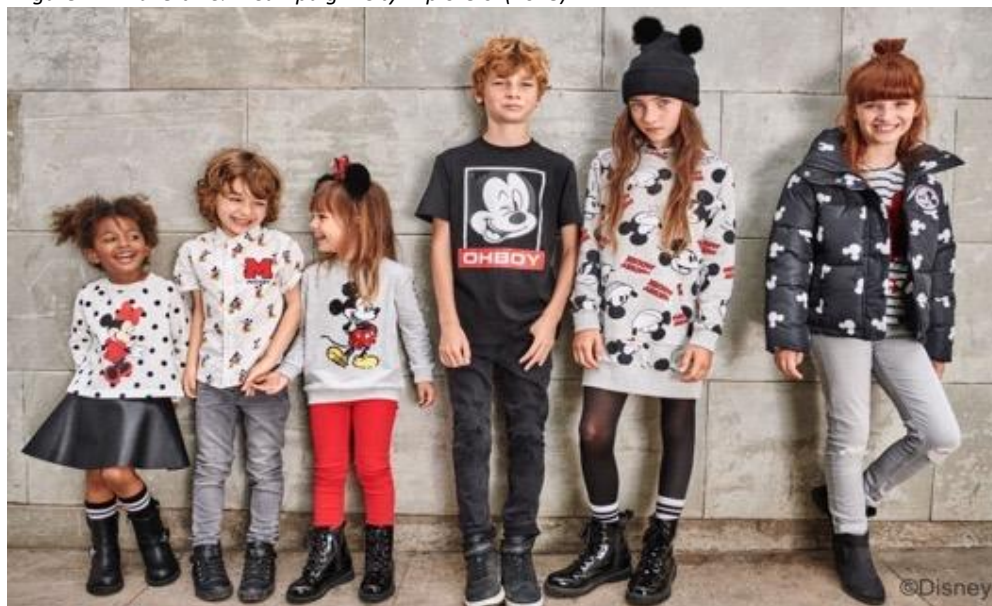
Figure 3.2: Advert H&M Campaign 'City Explorers' (2018)

At the time, there were different images that she showed for the attendees to look and debate the issues with the photos. The general consensus in the room was that the images seemed tokenistic. Since this talk, I again revisited the H&M