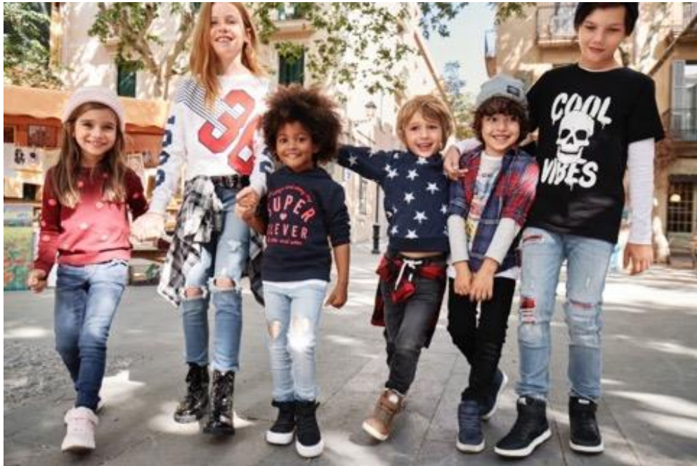
Figure 4.1: Advert H&M Campaign 'City Explorers' (2018)

the use of young mixed children in both television and print mediums and used the H&M 2015 clothing campaign as an example.