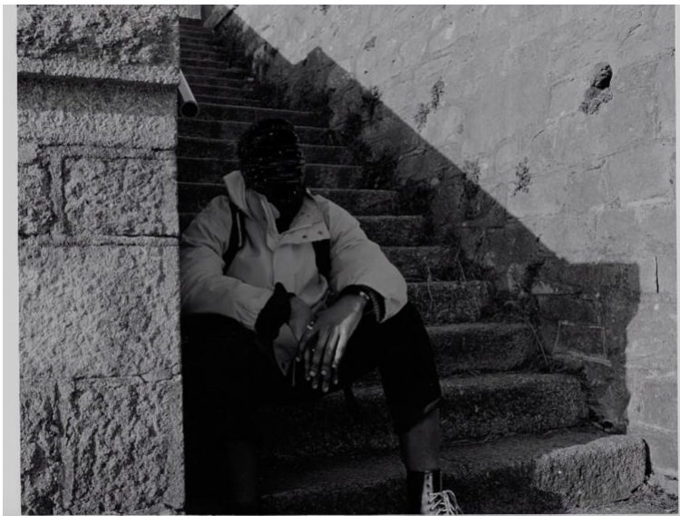
Figure 4.1: Welcome To My City performance (2017)

Having said this, the personal gain of creating Welcome To My City is far greater than any reservations I have had about sharing the piece to a wider audience. I have established that my intersectional experience is different to others, however, the purpose is to inspire individuals that experience the complexities that I have. Through the broadcasting of an auto ethnographical digital performance, I would allow a broader demographic to access it outside the location that the work is situated. The possible generated relatability to this piece would encourage an exploration of identity by persons finding themselves in intersections different to my own.