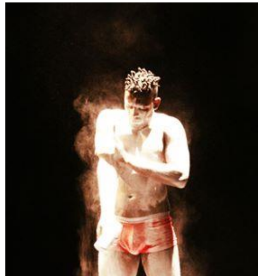
Figure 3.2: What Colour Do You See? Performance (2015)

After reviewing the work, I felt that both the "whiting up" and "Blacking up" needed to be part of the final video installation, instead of the use of white paint, I used talcum powder (figure 2.1 and 2.2). This was done so that I was able to apply the Black paint on top the talcum powder without the colours mixing and creating a grey colour. This was important due to the prominence of white and Black in Race theory and also the prominence in the binary that I was offered in being Black British. As Blackness is often excluded from British culture historically