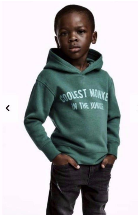
Appendix 3:3 'Coolest monkey in the jungle' January 2018

In looking at H&M's campaigns it is possible to come to the conclusion that shades of skin are viewed and presented differently, darker skin tones are furthest away from whiteness and worst as a result.